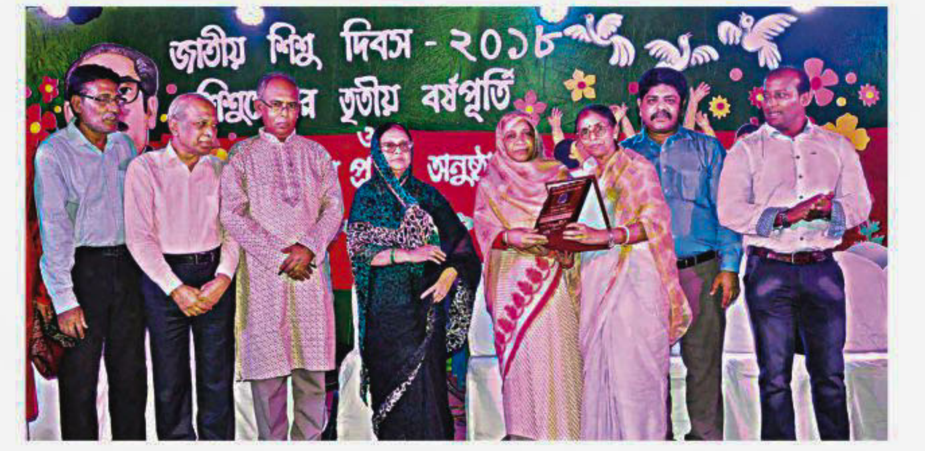
The honorees pose for a group photo.

the organising committee chaired the programme. As Children's Day is celebrated on the birth anniversary of Bangabadhu Sheikh Mujibur Rahman -- speakers at the programme hoped that the children in the audience would prepare themselves as worthy citizens of the country. A cultural programme followed an award giving ceremony.