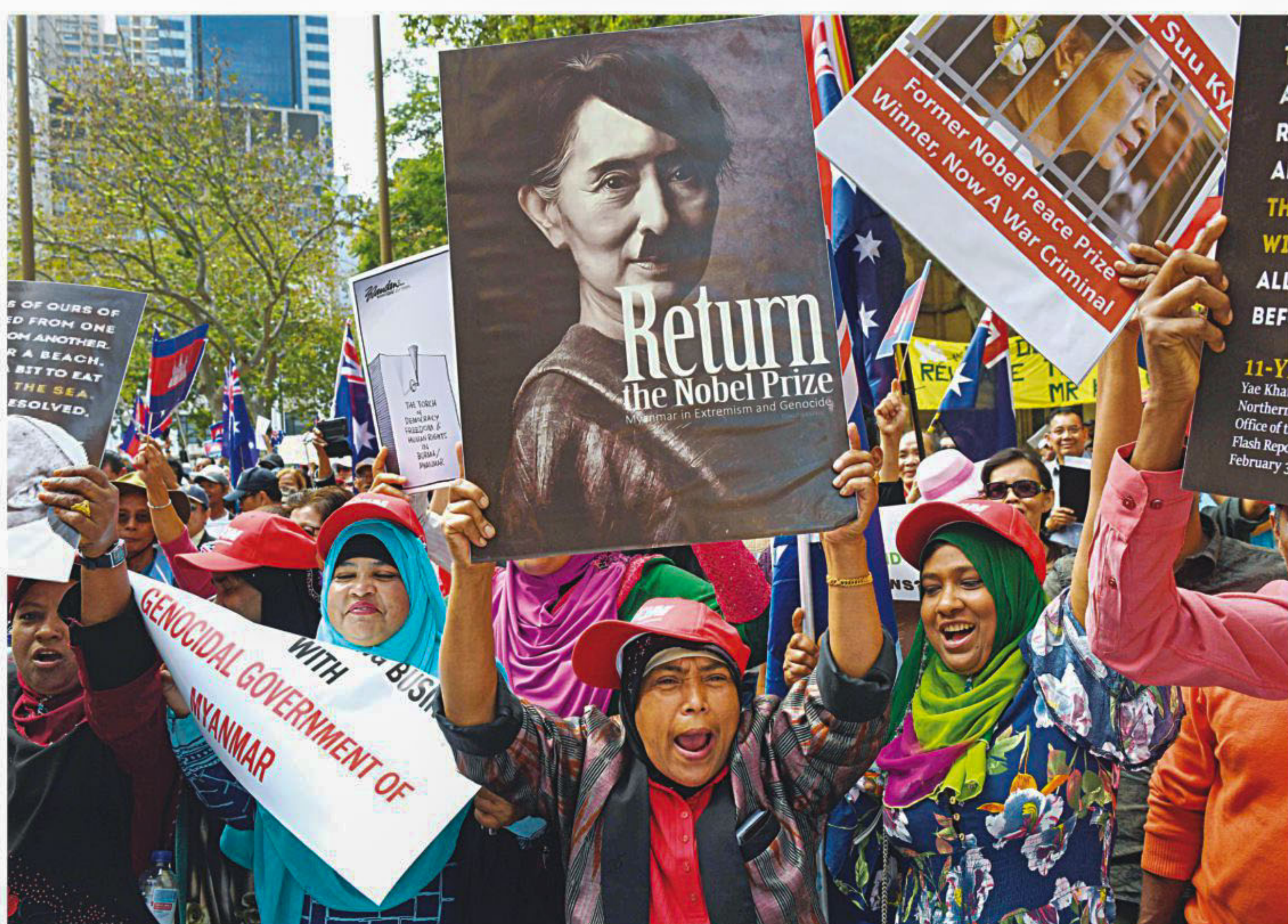
Protesters demonstrate against Myanmar's State Counselor Aung San Suu Kyi, who is participating in the Asean - Australia Special Summit in Sydney, yesterday.