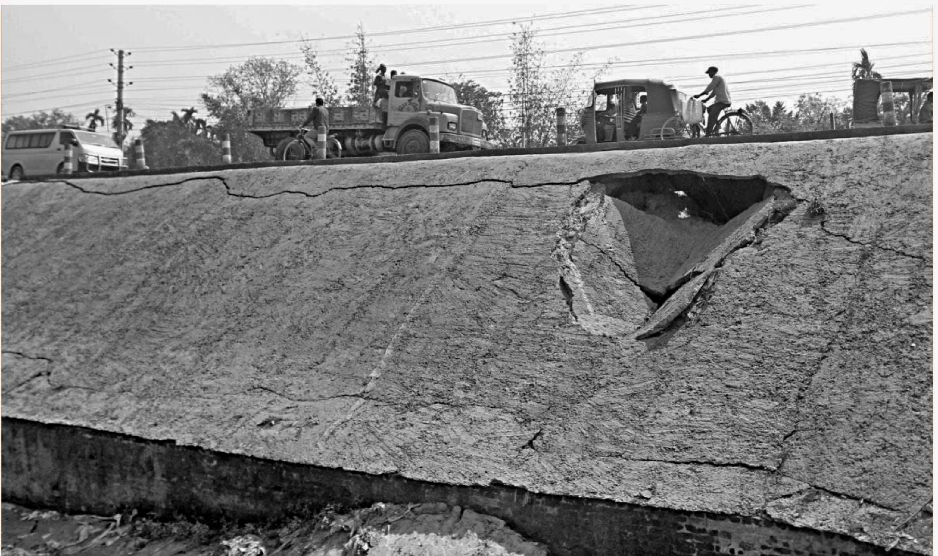
The approach road of Kagmari Bridge on Tangail-Nagarpur-Aricha road near Tangail town remains vulnerable to fatal accidents anytime as large cracks that developed on the busy road during last year's rains are yet to be repaired.