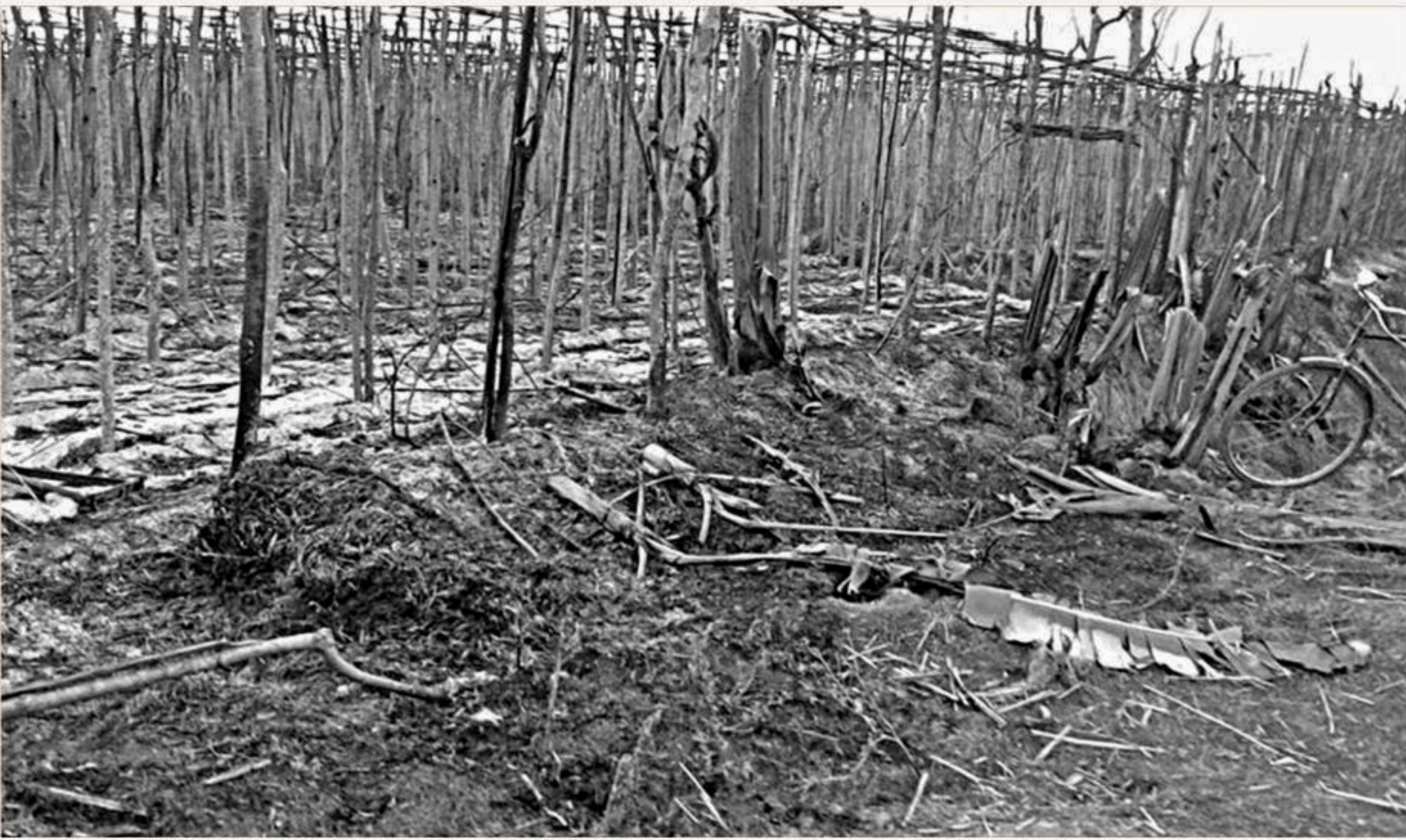
Charred remains at a betel garden of Bahadurpur village in Bheramara upazila of Kushtia after a devastating fire destroyed betel plantations on 200 bighas of land in the area on Sunday.