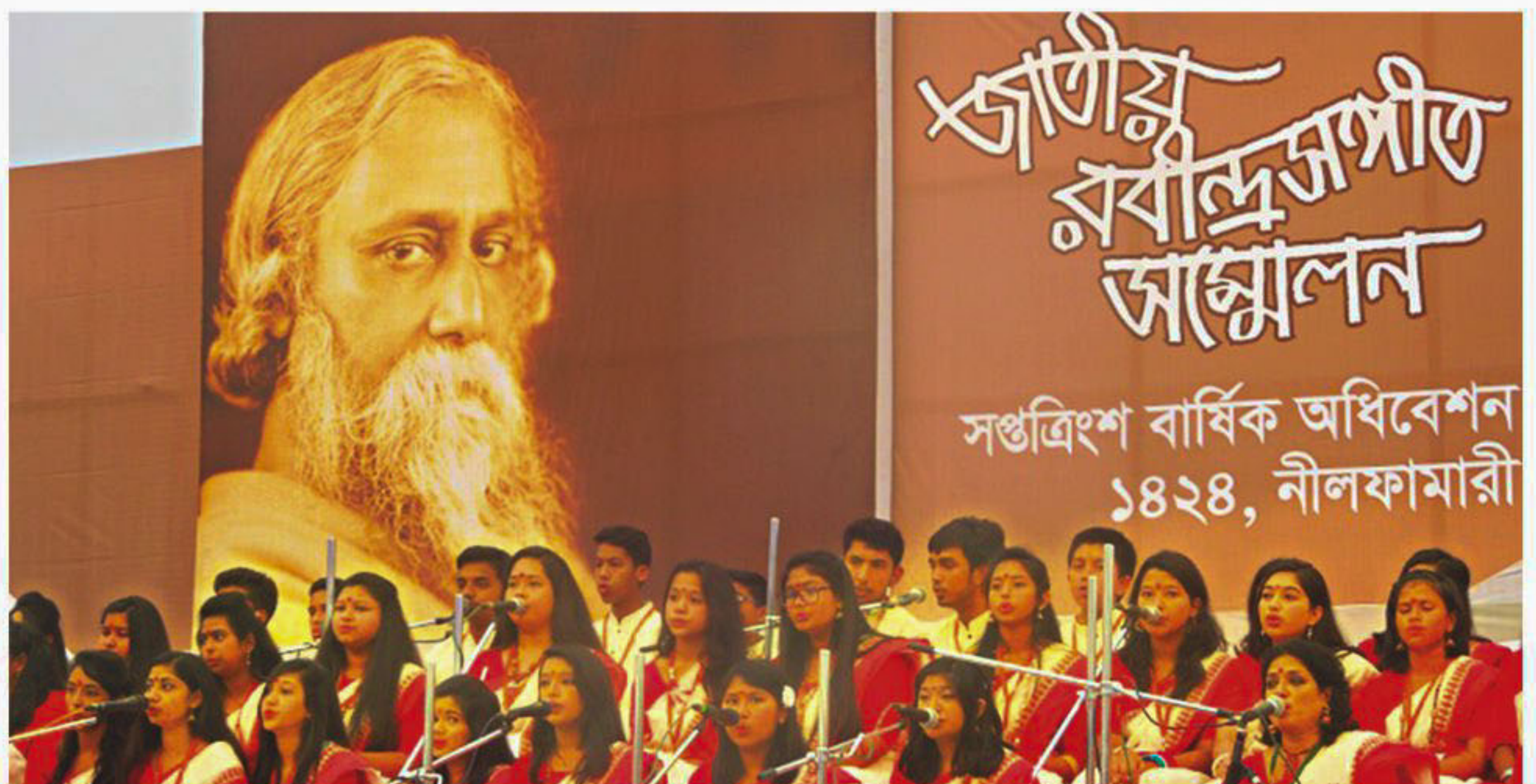
Artistes render a chorus at the opening ceremony.