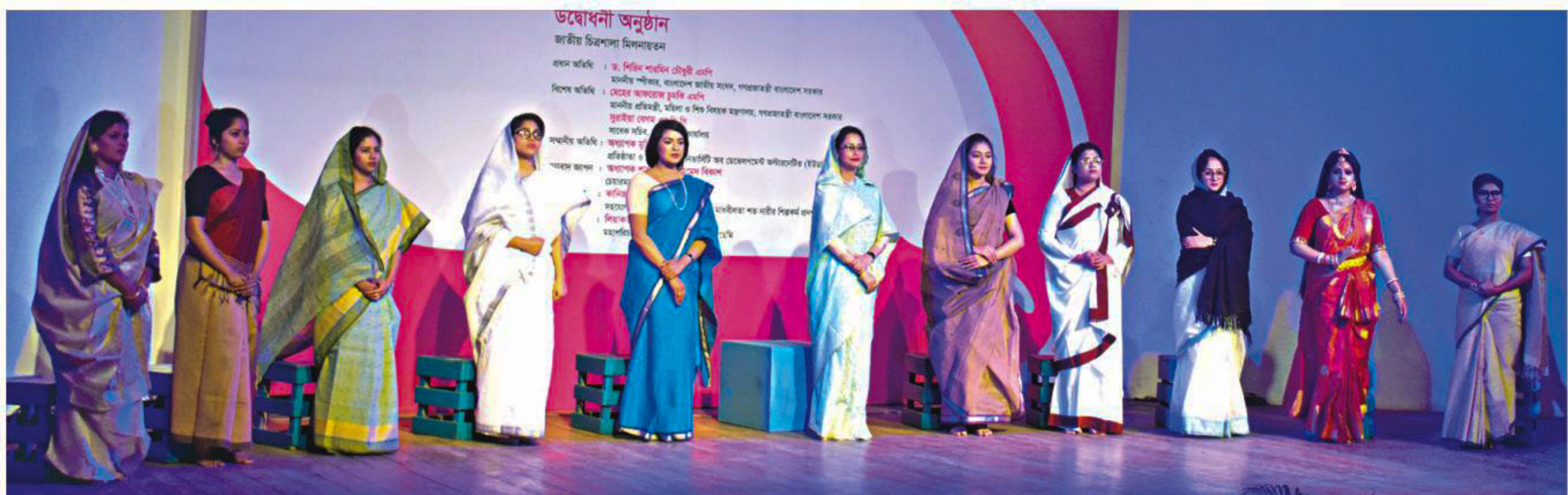
Women at the inaugural ceremony of the programme.