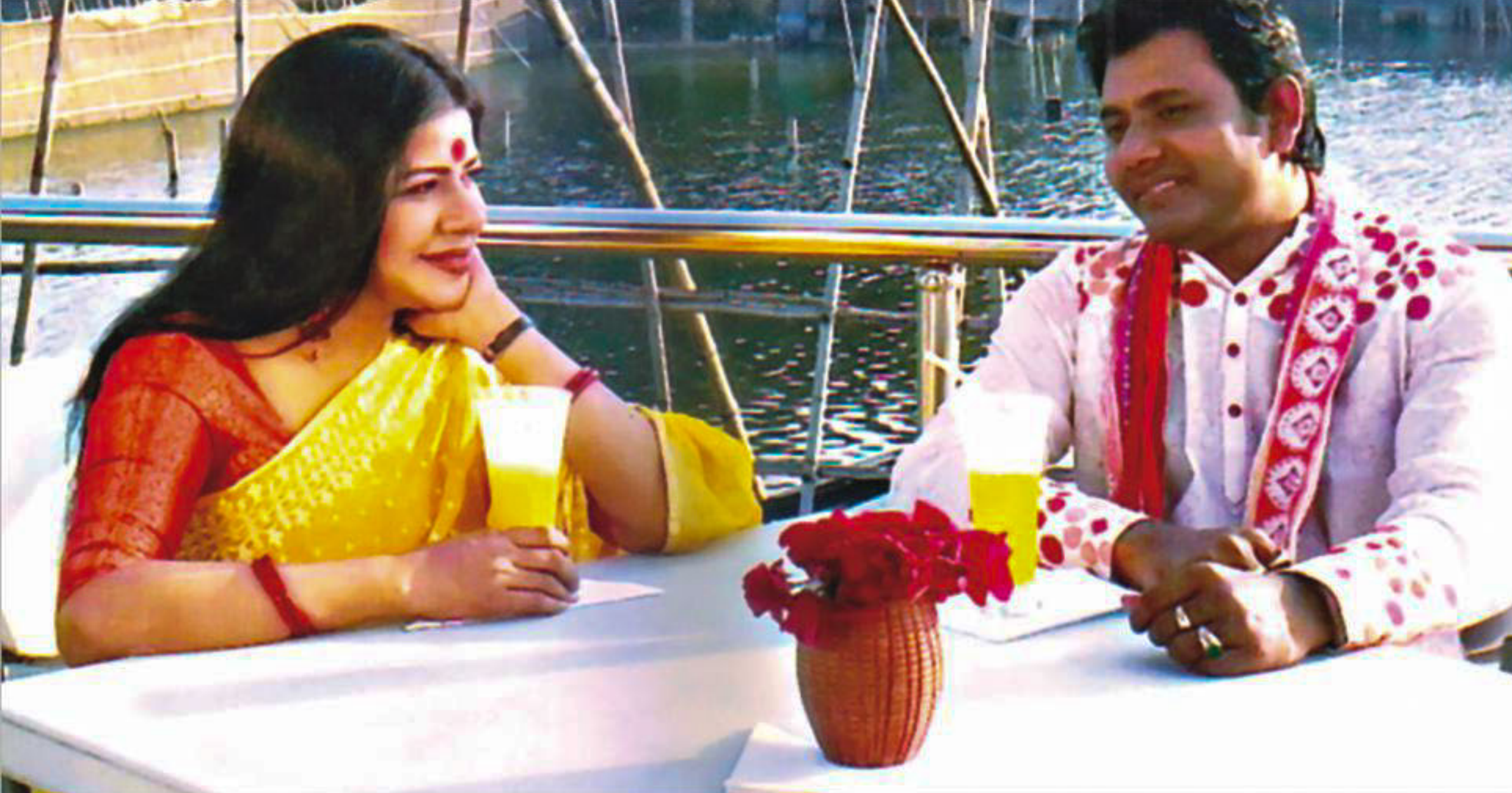
A scene from the play.