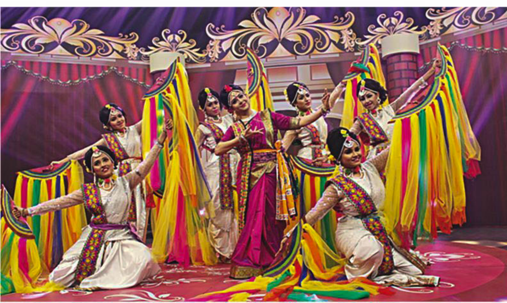
A scene from the programme.