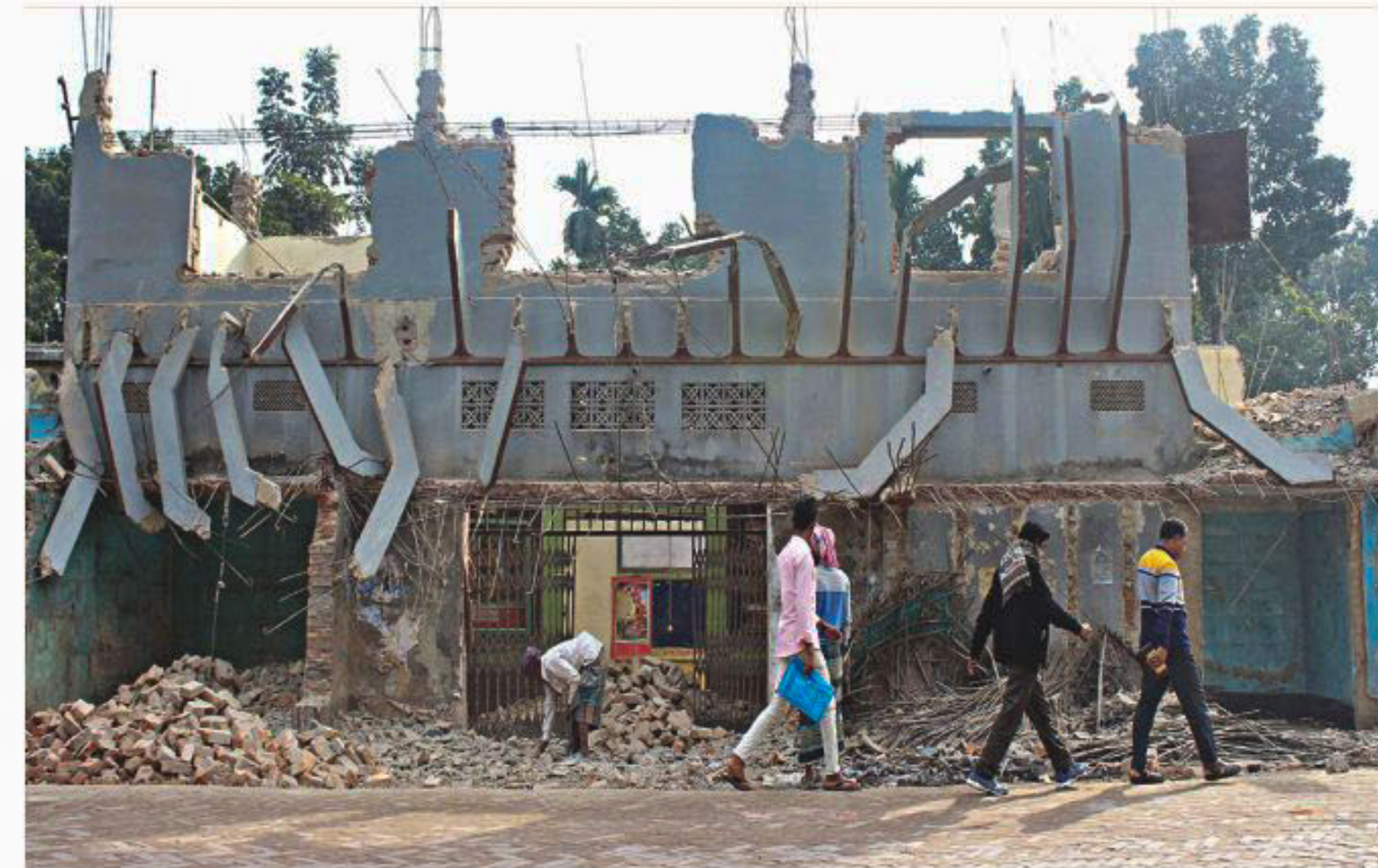
Demolition underway of Rajbari's largest cinema hall at Boropul.