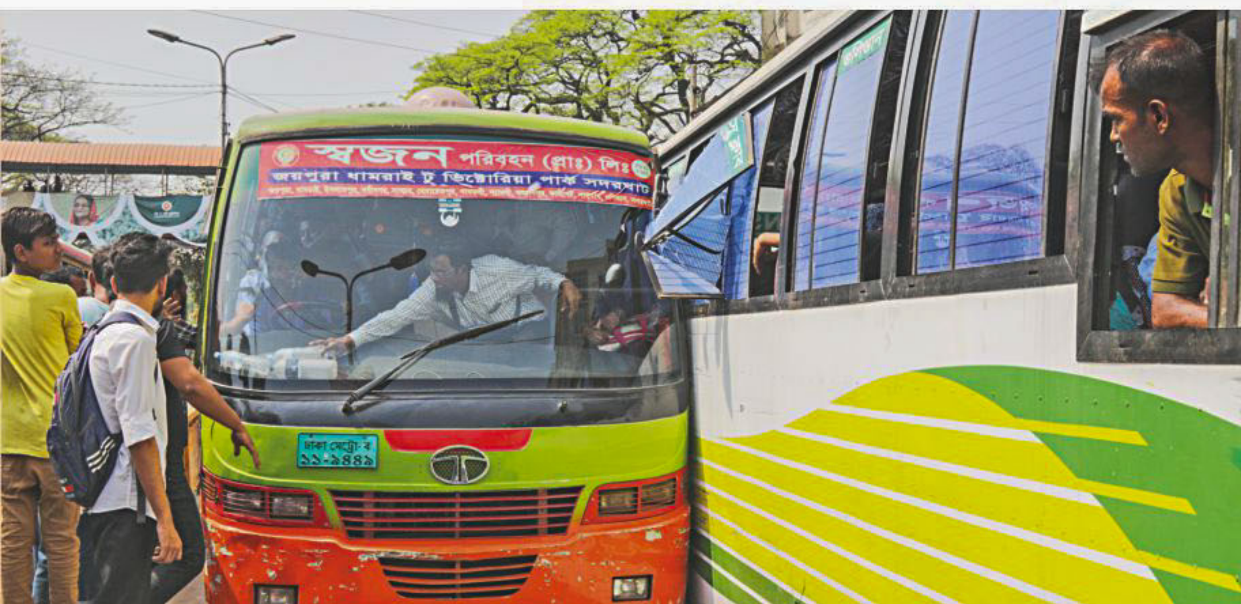
Disregarding public safety and violating traffic rules, bus drivers often engage in drag races on the streets of Dhaka. Two such buses yesterday rubbed against each other on Topkhana Road across Jatiya Press Club around noon, causing a tailback in the area. No injury was reported. The two buses later went about their business without any action by law enforcers.