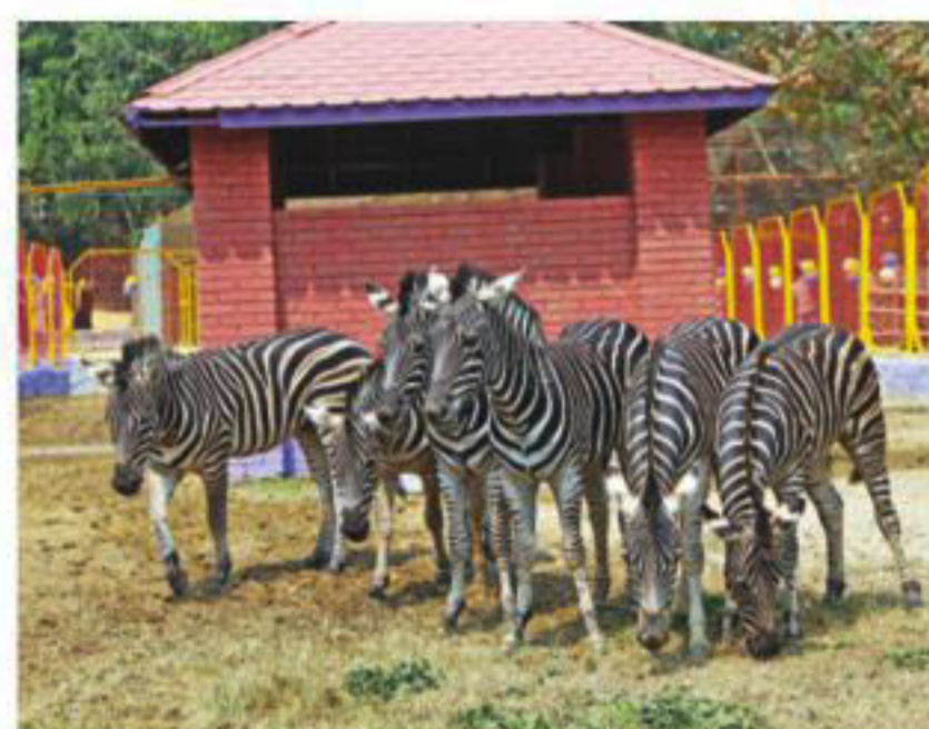
The six new residents.

been made to treat the animals. A guard wall to protest the cages along the hilly slope has also been installed," the curator said, adding, "Adequate food is being given to the animals now."