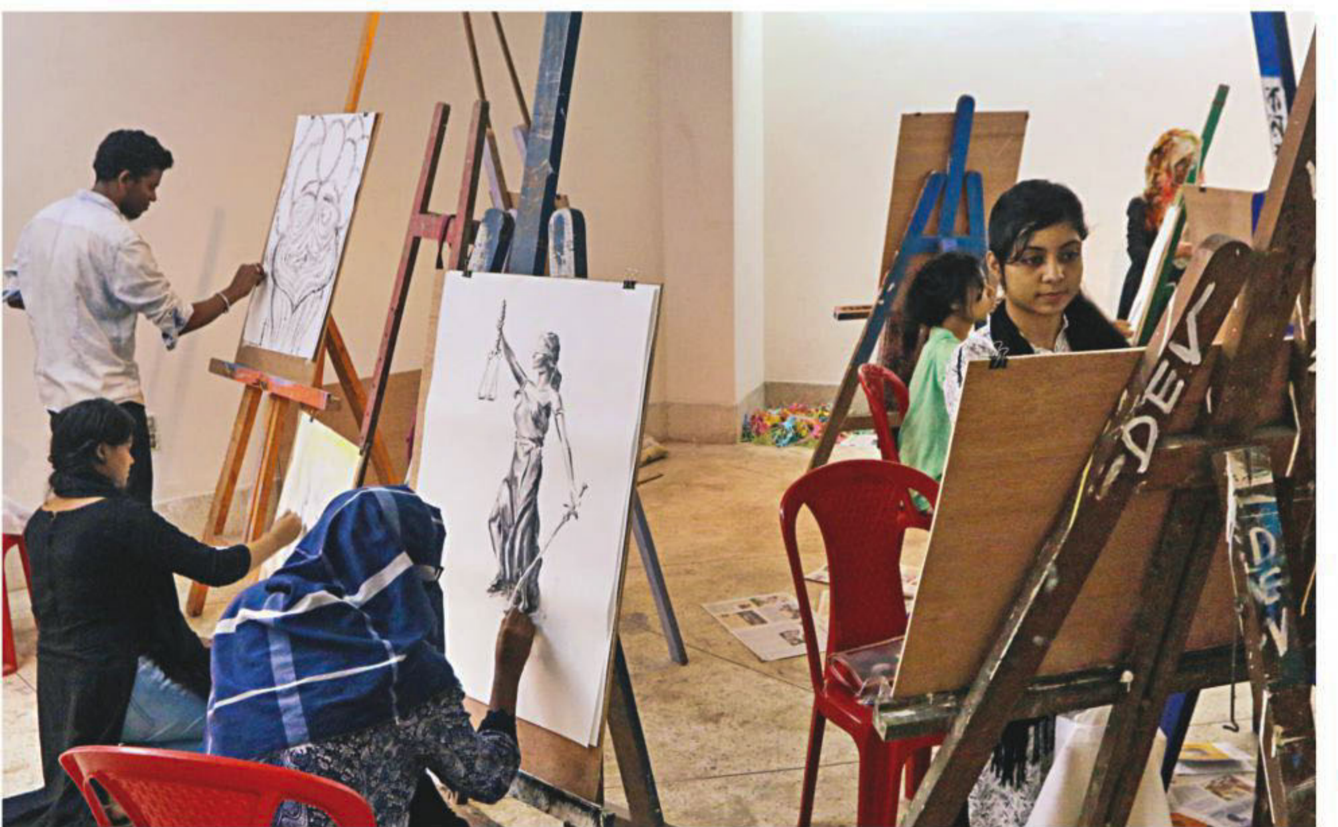
Students of the Institute of Fine Arts of Chittagong University at a daylong art camp at the institute yesterday. The camp titled, "Equality through dignity", was organised by Manusher Jonno Foundation and the fine arts institute. Story on page 4.