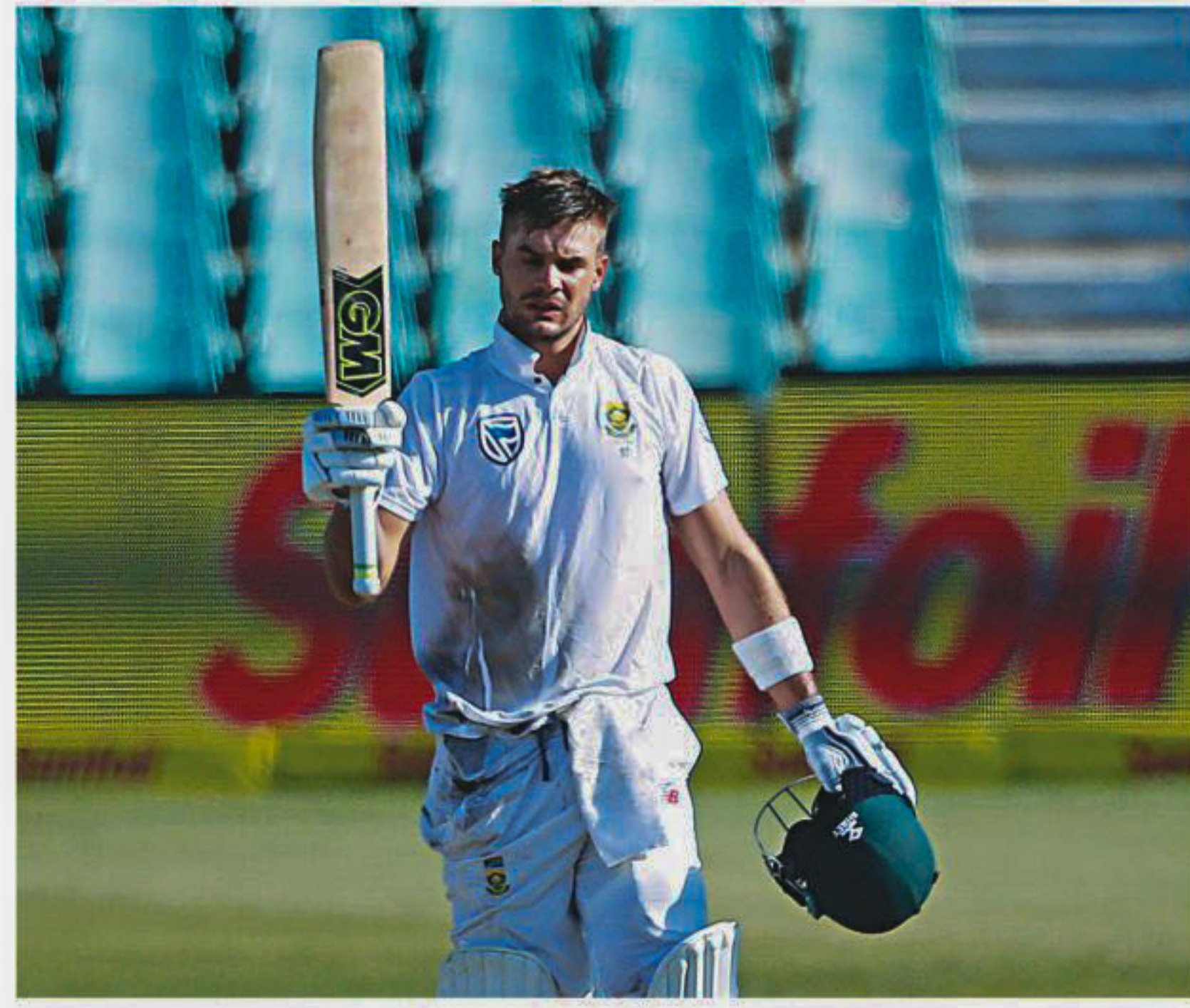
South Africa opener Aiden Markram acknowledges the applause after reaching his third Test ton on the fourth day of the first Test against Australia in Durban yesterday.

SOUTH AFRICA: Second innings 293 for 9 (Markram 143, De Bruyn 36, De Kock 81 not out; Starc 4-74, Hazlewood 2-57)