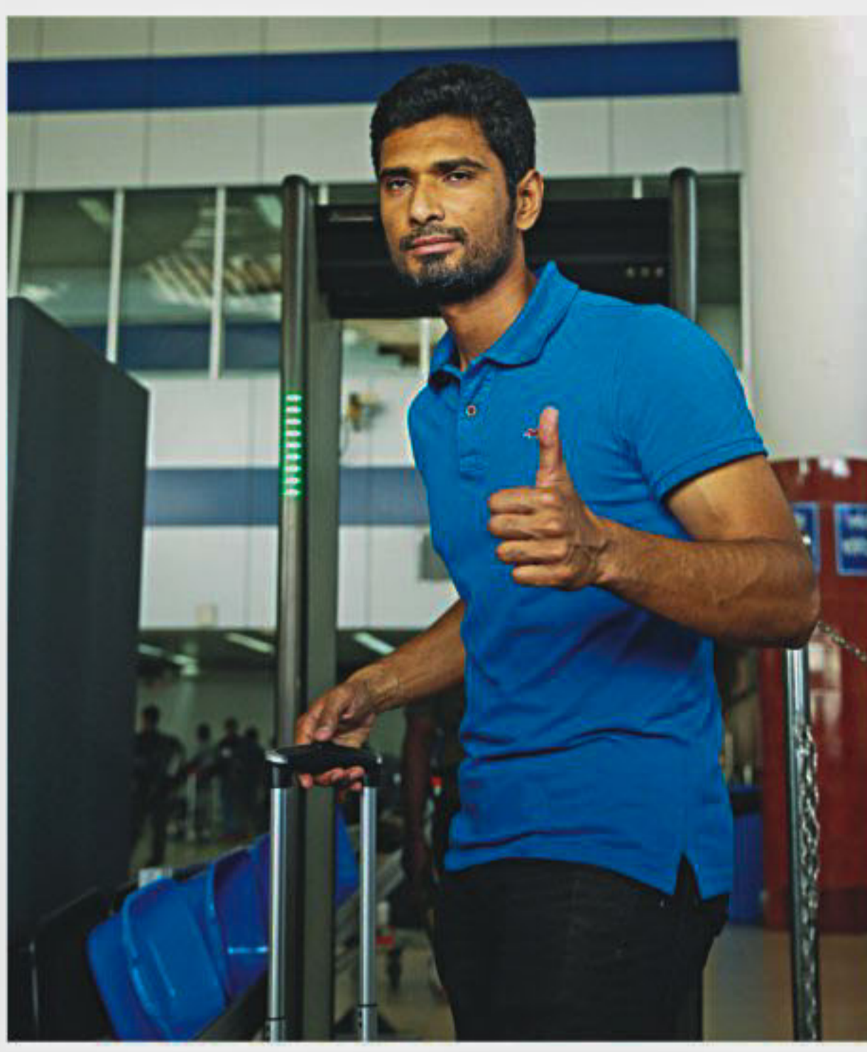
There was a lot of optimism from Bangladesh skipper Mahmudullah Riyad (L) before the team departed for Sri Lanka yesterday and the good mood persisted when they reached their hotel in Colombo (R) a few hours later, but their positivity will be most important when they kick off their T20I tri-series campaign against India on March 8.

Given that their first match is against mighty India on Thursday, it will be interesting to see how long this positivity lasts.