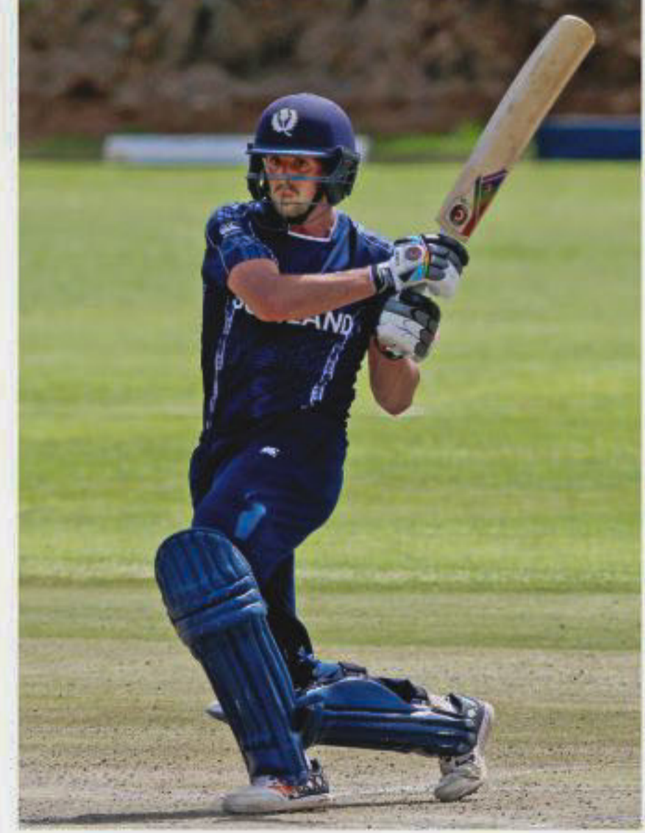
Calum MacLeod's unbeaten 157 off 146 balls powered Scotland to a seven-wicket victory against Afghanistan in the ICC World Cup qualifiers in Bulawayo yesterday.

Player-of-the-match: Calum MacLeod. ZIMBABWE: 380 for 6 in 50 overs (Zhuwao 41, Mire 52, Taylor 100, Ervine 34, Raza 123; Kami 2-82, Regmi 2-69)