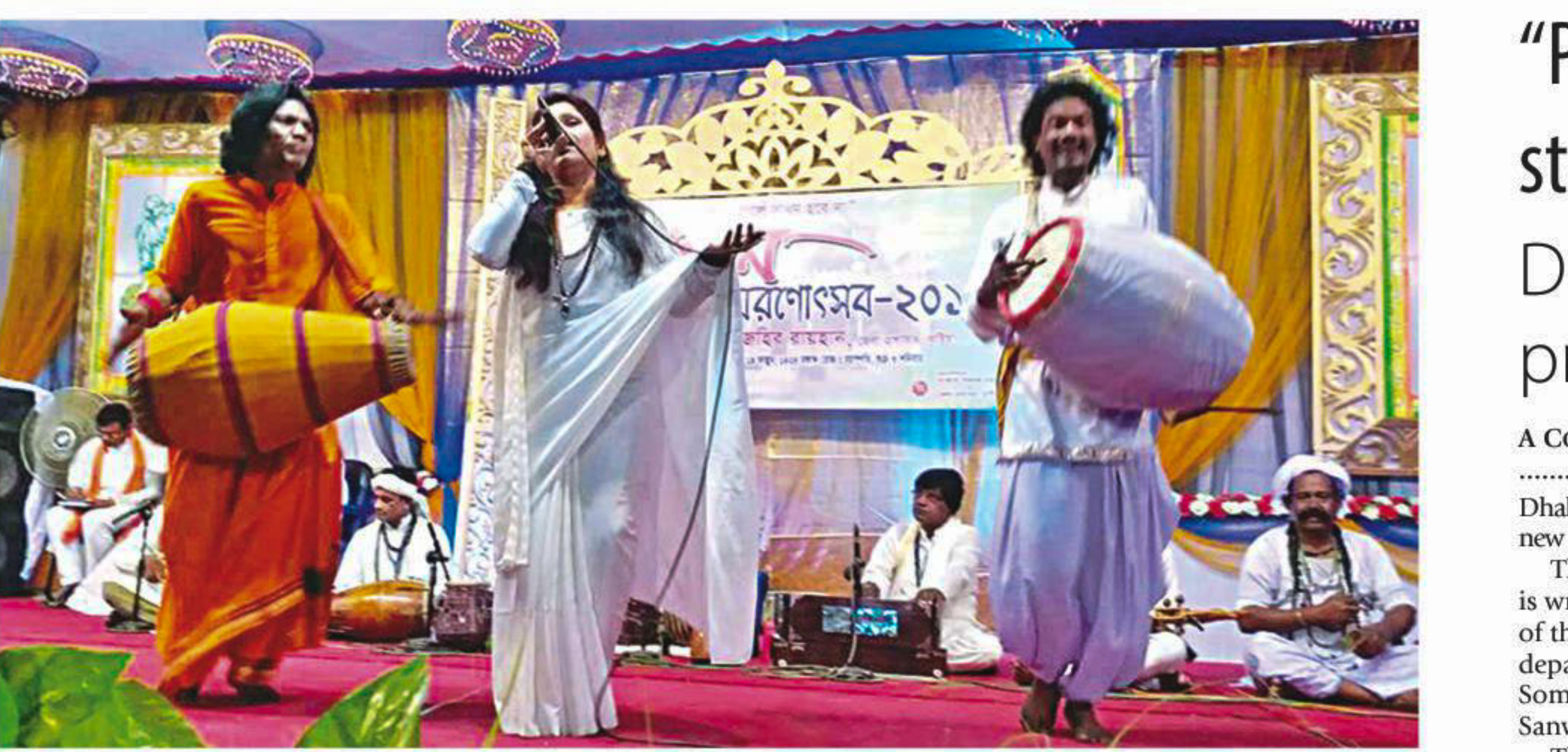
Artistes render spiritual songs of Lalon on stage at the event.