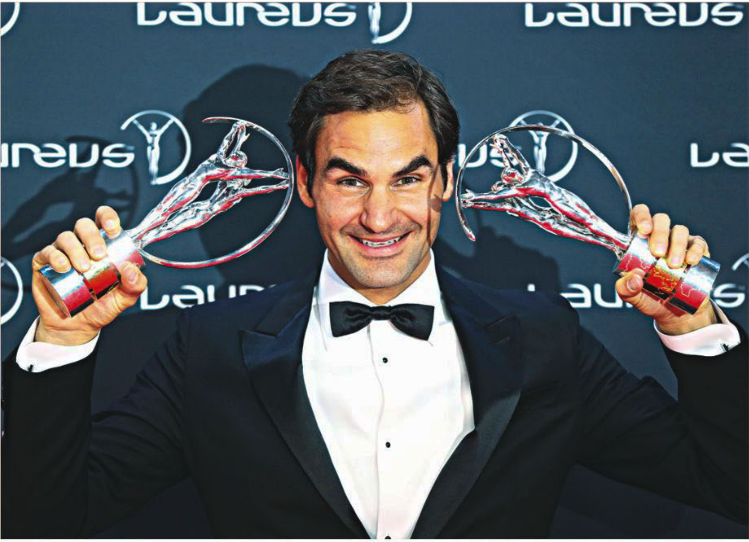
After a stunning resurgence in 2017 which saw him claim the Australian Open and Wimbledon crowns before becoming the oldest World No. 1 in tennis history, Roger Federer was honoured at the Laureus Sports Awards 2018 with two trophies -- the Sportsman of the Year and Comeback of the Year awards.