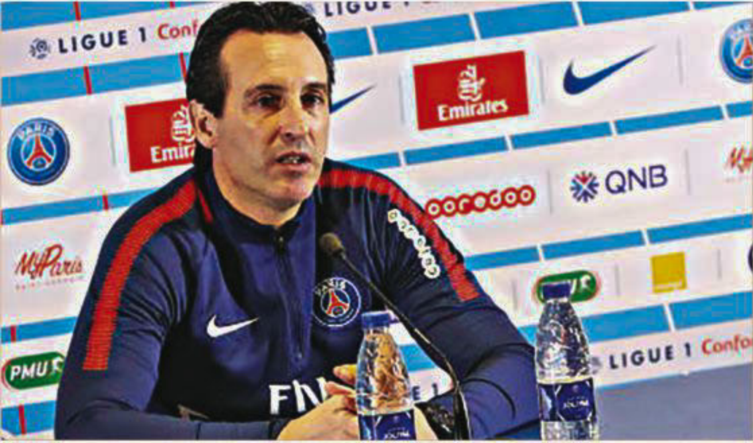
PSG coach Unai Emery binned rumours that Neymar would be out for the season, adding that the Brazilian had a slim chance to face Real Madrid on March 7.

AFP, Paris Neymar still has a "small chance" of playing against Real Madrid in the Champions League and there are no plans for an operation on his cracked bone, Paris Saint-Germain coach Unai Emery said on Tuesday. "For Neymar there has been no decision to have an operation," said Emery, denying an earlier report in the Brazilian press that the world's most expensive player would go under the knife to fix the cracked bone in his foot. "Neymar is the first to want to play every match, he's very focussed on Real. I think there's a small chance that he'll be ready for the match," added Emery. PSG trail 3-1 from the last 16 first leg in Madrid two weeks ago and the loss of Neymar would be a huge blow to their chances of overturning that deficit at the Parc des Princes on March 6 and reaching the Champions League quarter-finals. Neymar suffered a cracked metatarsal in his foot and a twisted ankle in an innocuous looking incident against Marseille on Sunday night. And while Emery said there is a possibility he'll recover by next week, he was more pessimistic than he had been on Sunday. "Today, after analysing Neymar, it looks less likely than it did on Sunday that he'll be ready for this match." However, he was clear in his dismissal of a report published by Brazilian outlet Globo Esporte on Tuesday that claimed a decision had been reached for Neymar to undergo an operation, and that he would be out until May. "Last night [Monday] the club issued an official statement: it said how