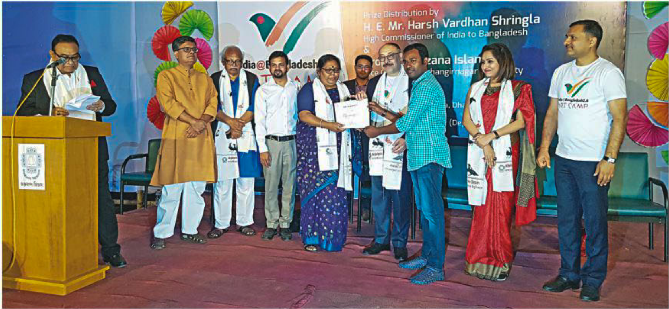
Guests hand out certificates to workshop participants.

Bollywood actors Arjun Kapoor and Parineeti Chopra, who are reuniting on-screen after six years for "Namaste England", have shared the first posters of the film. The shooting for the film began Friday in Amritsar, Punjab and is set to release on December 7. Directed by Vipul Amrutlal Shah, "Namaste England" traces the journey of Jasmeet and Param, their love story across the landscapes of India and Europe. Talking about his film, Vipul had earlier said, "From Amritsar, we move to Ludhiana and Patiala. We are filming at more than 75 locations spread across these three cities. Later, we'll also be shooting in Dhaka, Paris, Brussels and finally in London. That's how the love story progresses," according to Hindustan Times. He further elaborated on his lead characters, "Both their characters are from Punjab and this is the first time that Arjun and Parineeti will be playing genuine lovers. Away from the camera, they are good friends and are always joking and pranking. There's a lot of camaraderie and it's going to be fun working with them." Arjun and Parineeti both made their Bollywood debuts with "Ishaqzaade" in 2012.