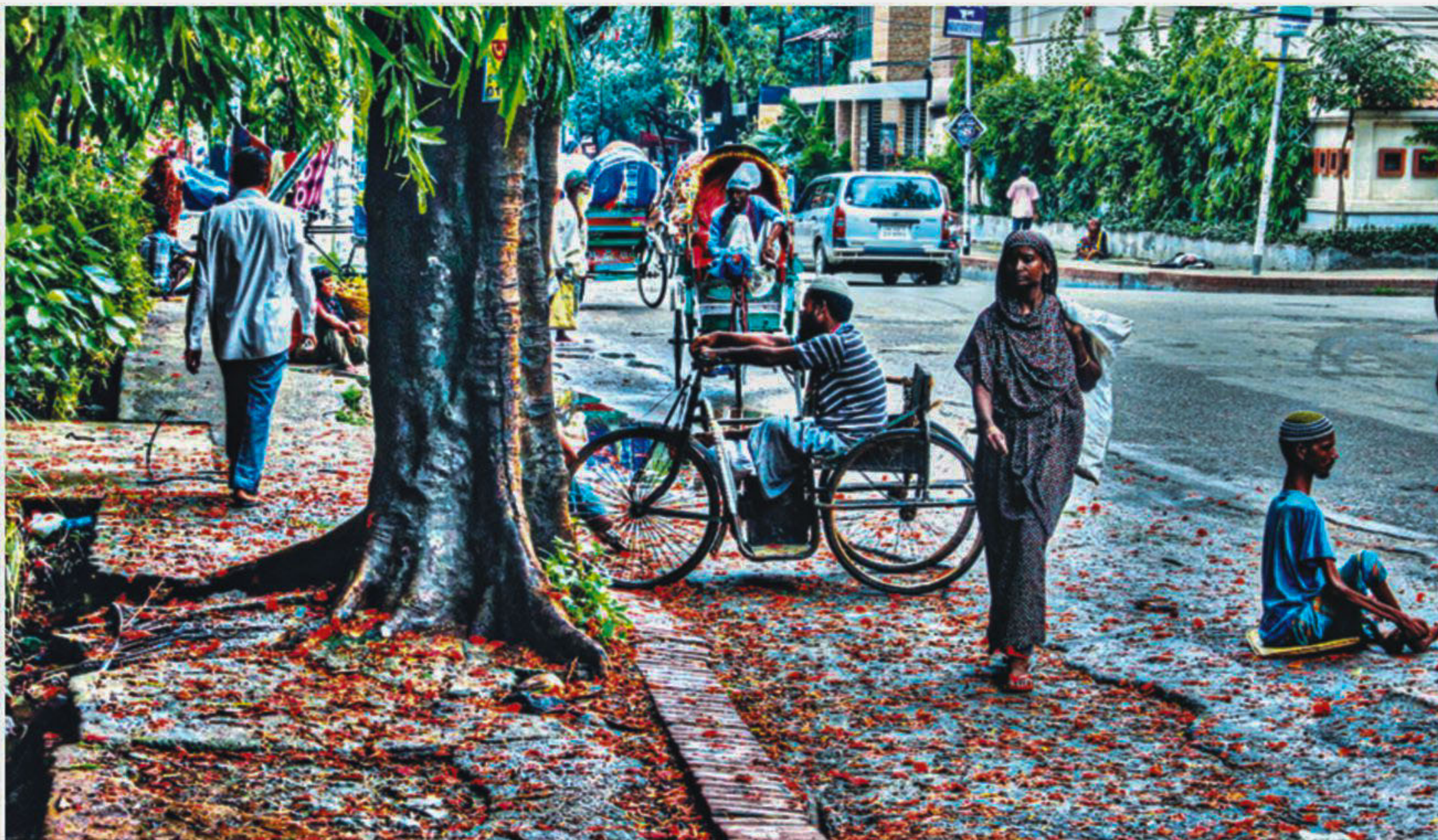
At a time when Bangladesh will be considered for graduation in 2018, about 30 million people will still be living below the national poverty line.

Policies, institutions, development praxis and incentives will need to be geared towards Bangladesh's graduation with momentum. Since there is a six-year period between the time Bangladesh will be considered for graduation (in 2018) and when she will finally graduate out of the LDC group (in 2024), Bangladesh will need to pursue a well-crafted graduation strategy during the time between these two key milestones. Review of experience of some of the graduating and graduated LDCs indicates that while some LDCs have been successful in graduating with momentum by taking appropriate preparations, in case of some of the other LDCs graduation had to be even deferred because of continuing susceptibility to challenges