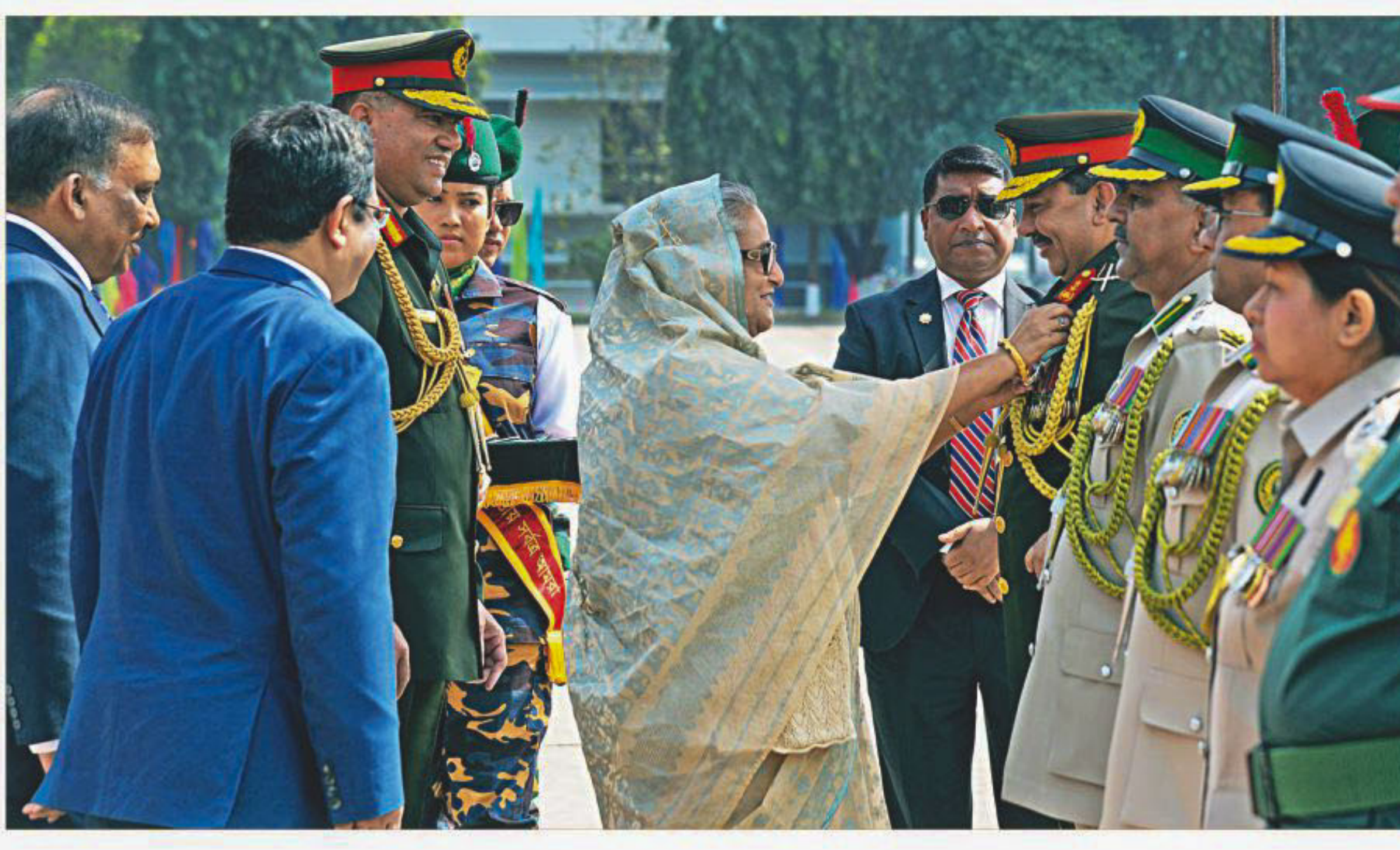
Prime Minister Sheikh Hasina awards an insignia to an Ansar official at the 38th National Rally of Bangladesh Ansar and Village Defence Party (VDP) at the force's academy in Safipur, Gazipur yesterday.

Bangladesh Tea Board is hosting the tea expo to create a national platform to exhibit and uphold the tea industry amongst the tea connoisseurs of the country.