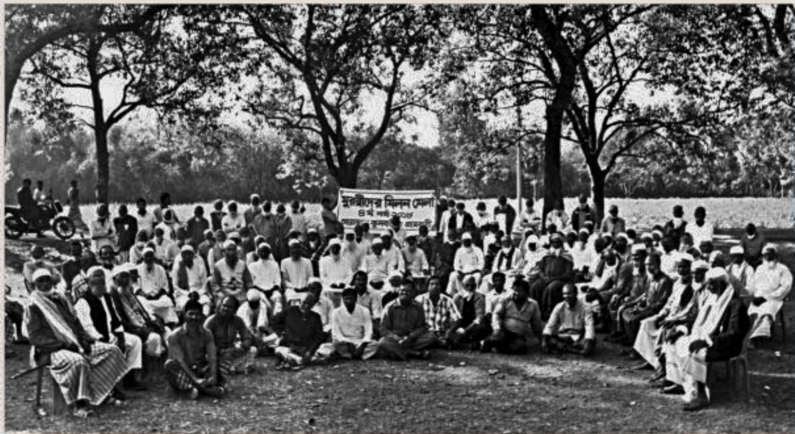
Senior citizens join a happy get-together on the ground of Kulbaria High School in Meherpur Sadar upazila on Friday.