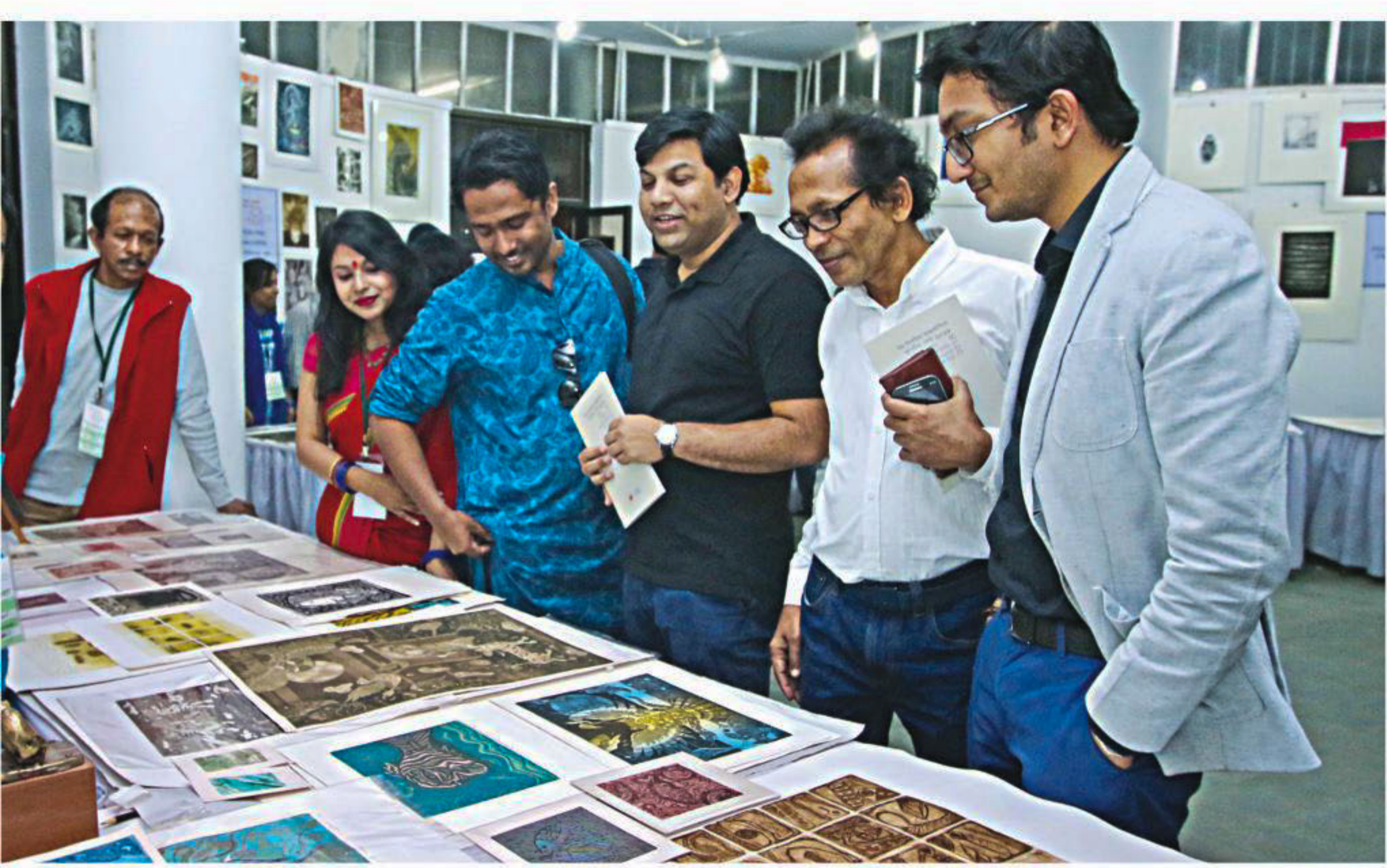
Visitors at the fair.