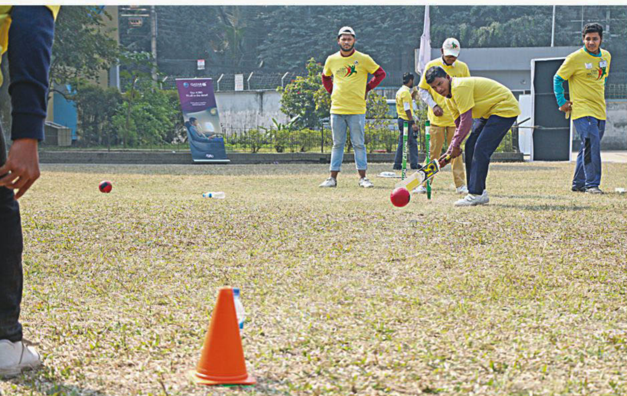
A visually impaired participant hits the ball in a game of cricket.