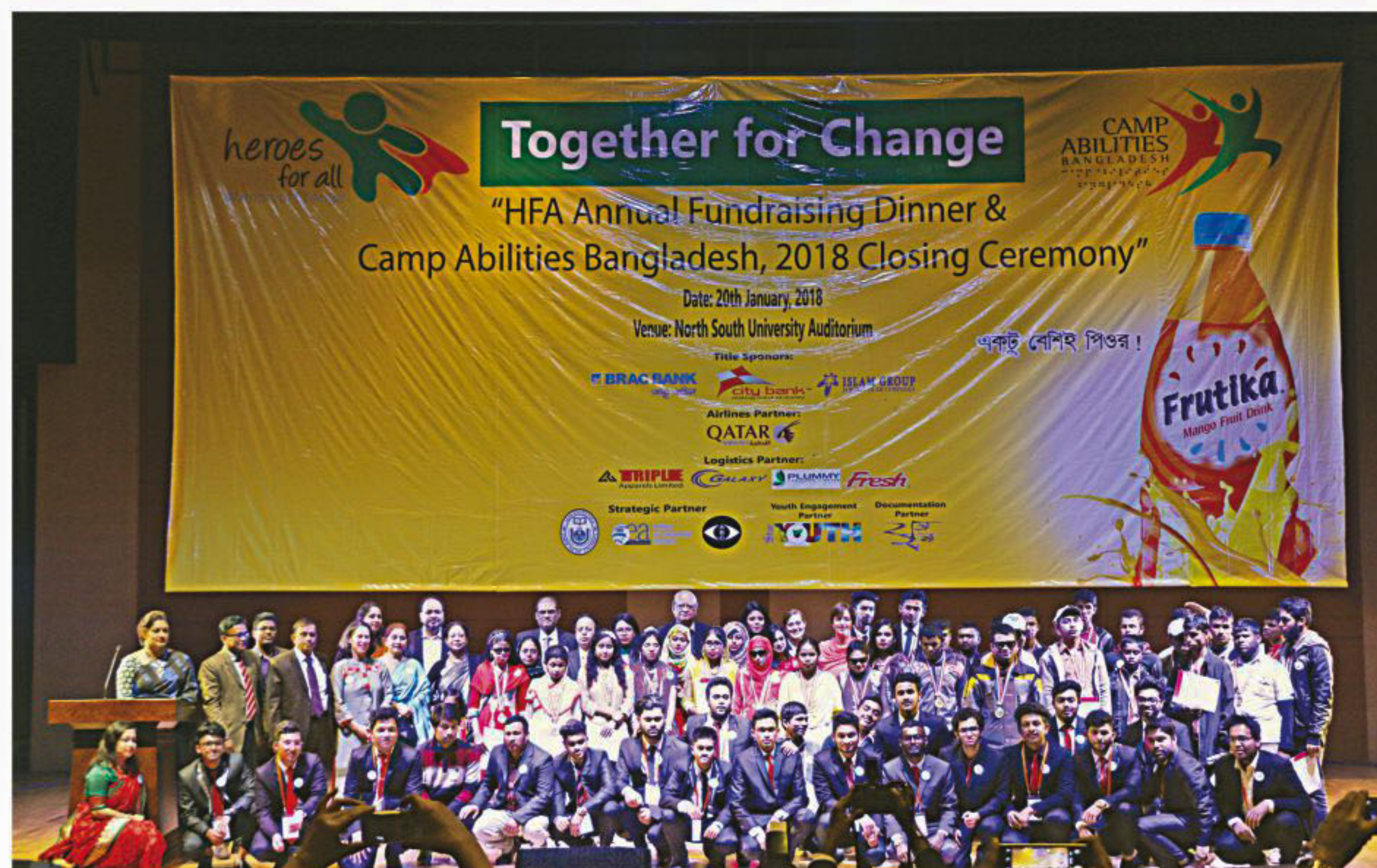
The fundraising dinner and closing ceremony of Camp Abilities Bangladesh took place at North South University.