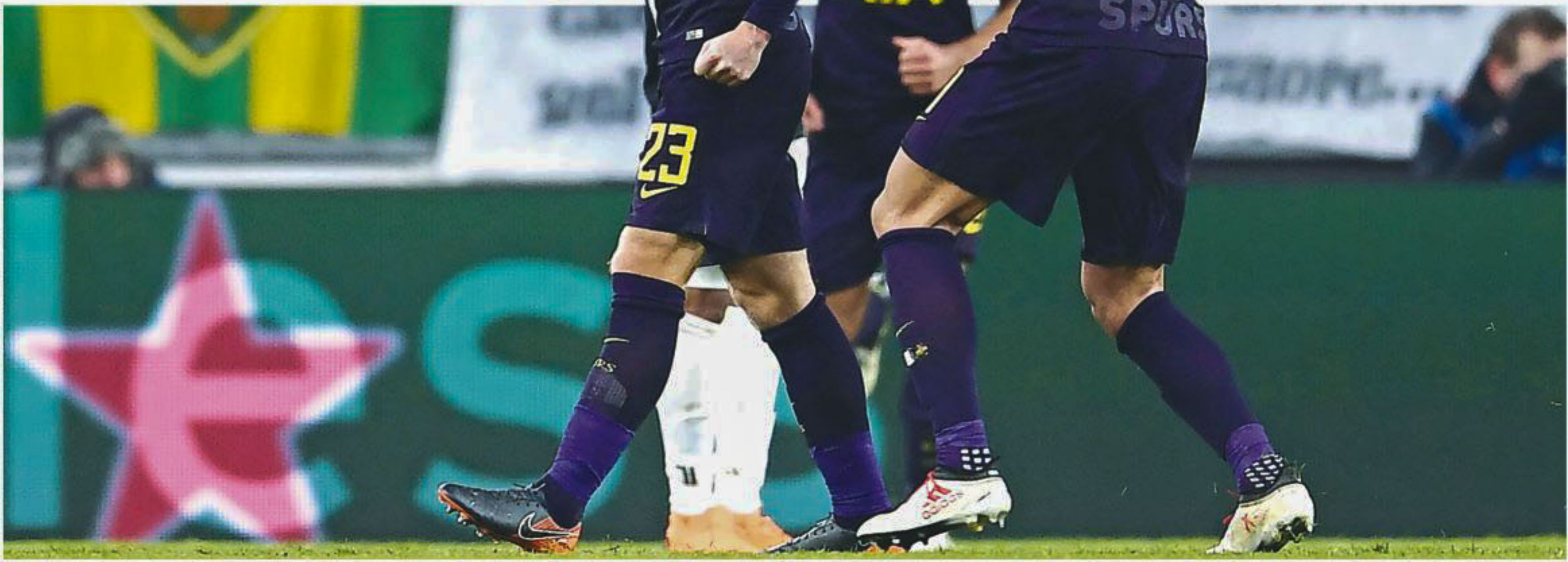
Tottenham's Christian Eriksen (L) provided a masterclass in midfield, standing out as the best player on the pitch against a vaunted Juventus side. He scored the equaliser with a sublime free-kick, hitting it under the wall and giving Gianluigi Buffon no chance as Spurs fought back from 2-0 down to take the away-goal advantage into the second leg.