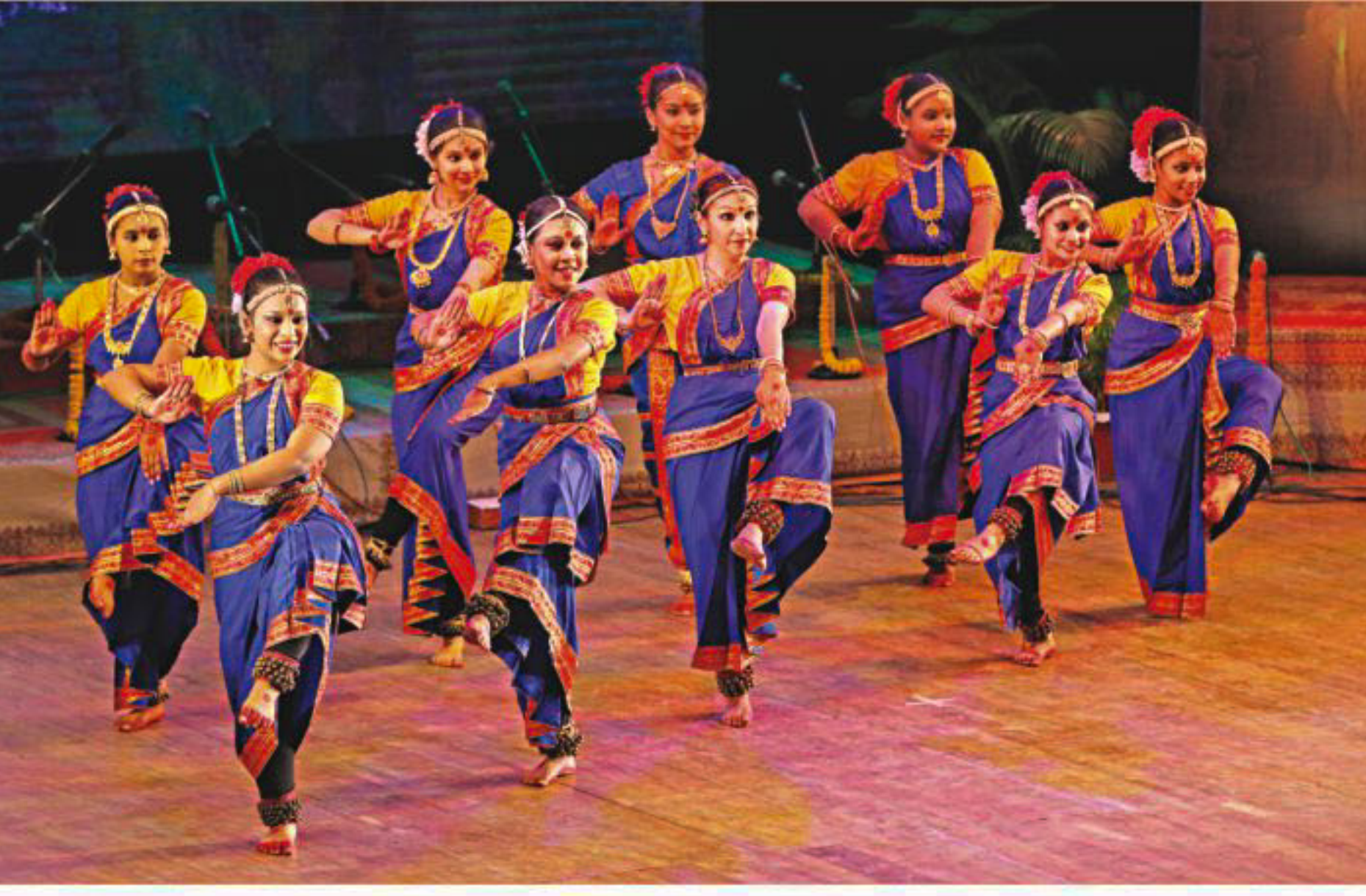
A group of artistes present Bharatnatyam dance on the opening day of the Classical Music and Dance Festival organised by Bangladesh Shilpakala Academy. The three-day event featuring vocal and instrumental classical music and classical dance forms, ends today.