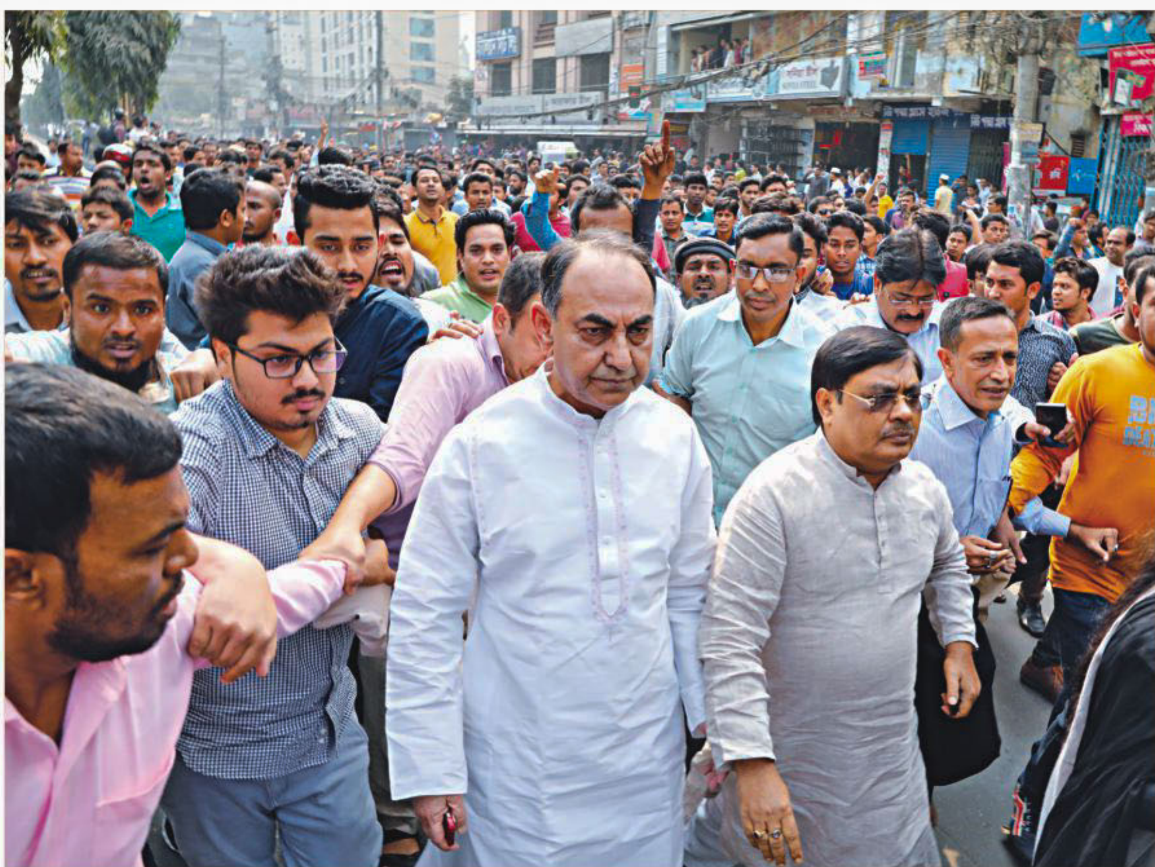
BNP leaders and activists in a procession yesterday afternoon near Baitul Mukarram mosque protesting the jail sentence of the party's chief Khaleda Zia. Police detained a few of them minutes after the procession was brought out and later chased the remaining protesters away.