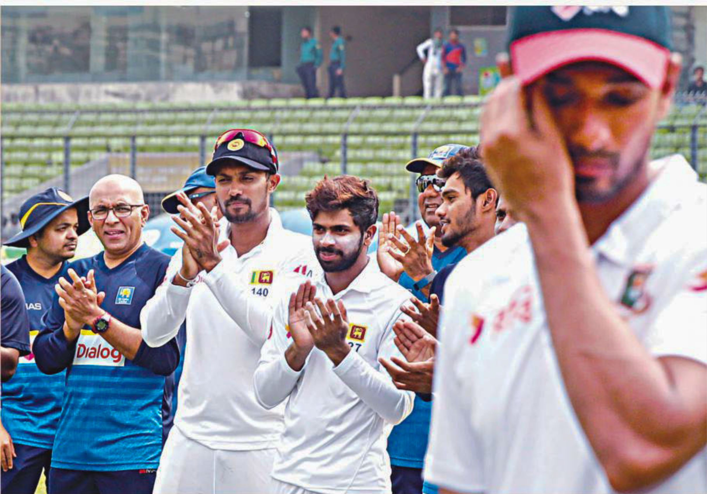
Stand-in Bangladesh captain Mahmudullah Riyad (right) sports a forlorn look during the presentation ceremony which his former coach Chandika Hathurusingha (second from left) relished after Sri Lanka's 215-run win in the second and final Test at Mirpur yesterday.