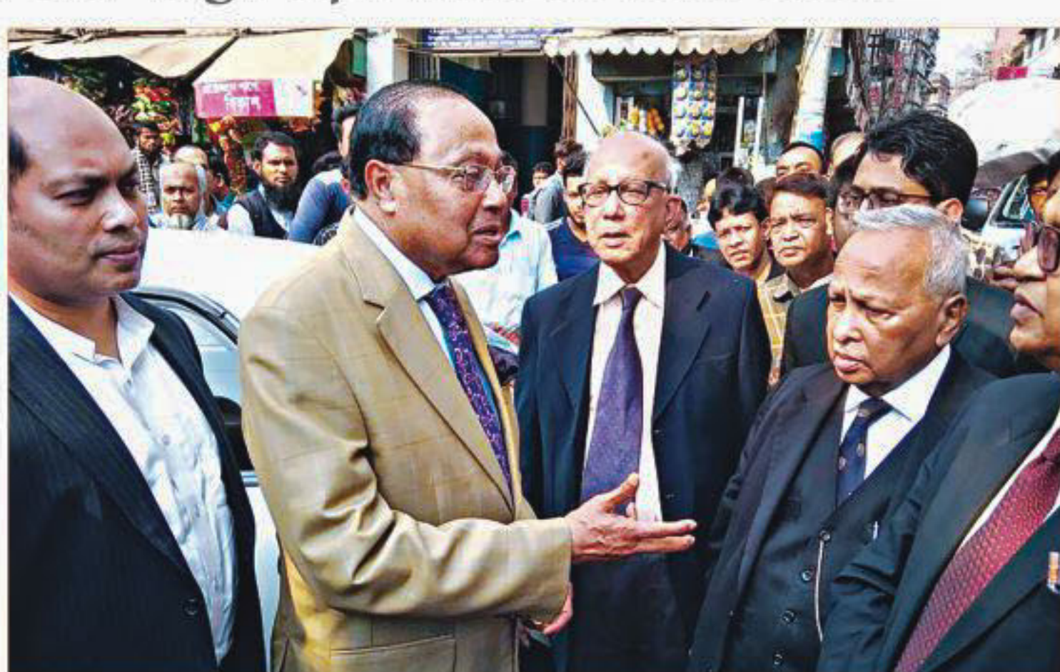
Senior BNP leaders wait outside the old Dhaka central jail yesterday morning to visit Khaleda.