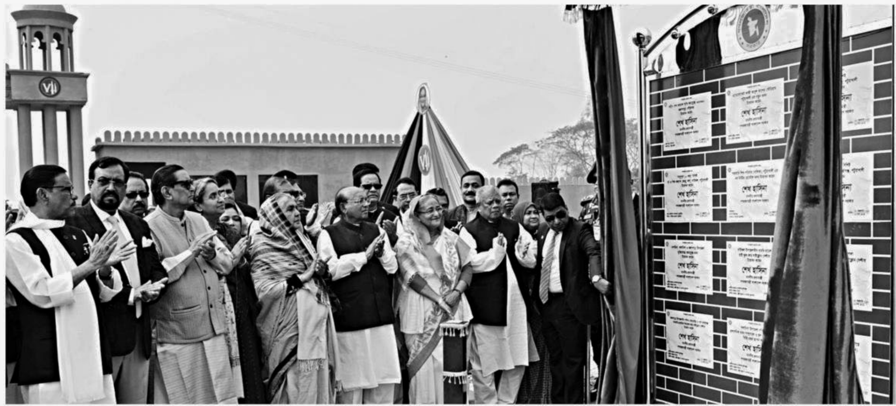
Prime Minister Sheikh Hasina inaugurates several development projects at Lebukhali in Patuakhali yesterday.

Our Savar and Brahmanbaria correspondents contributed to the reports.