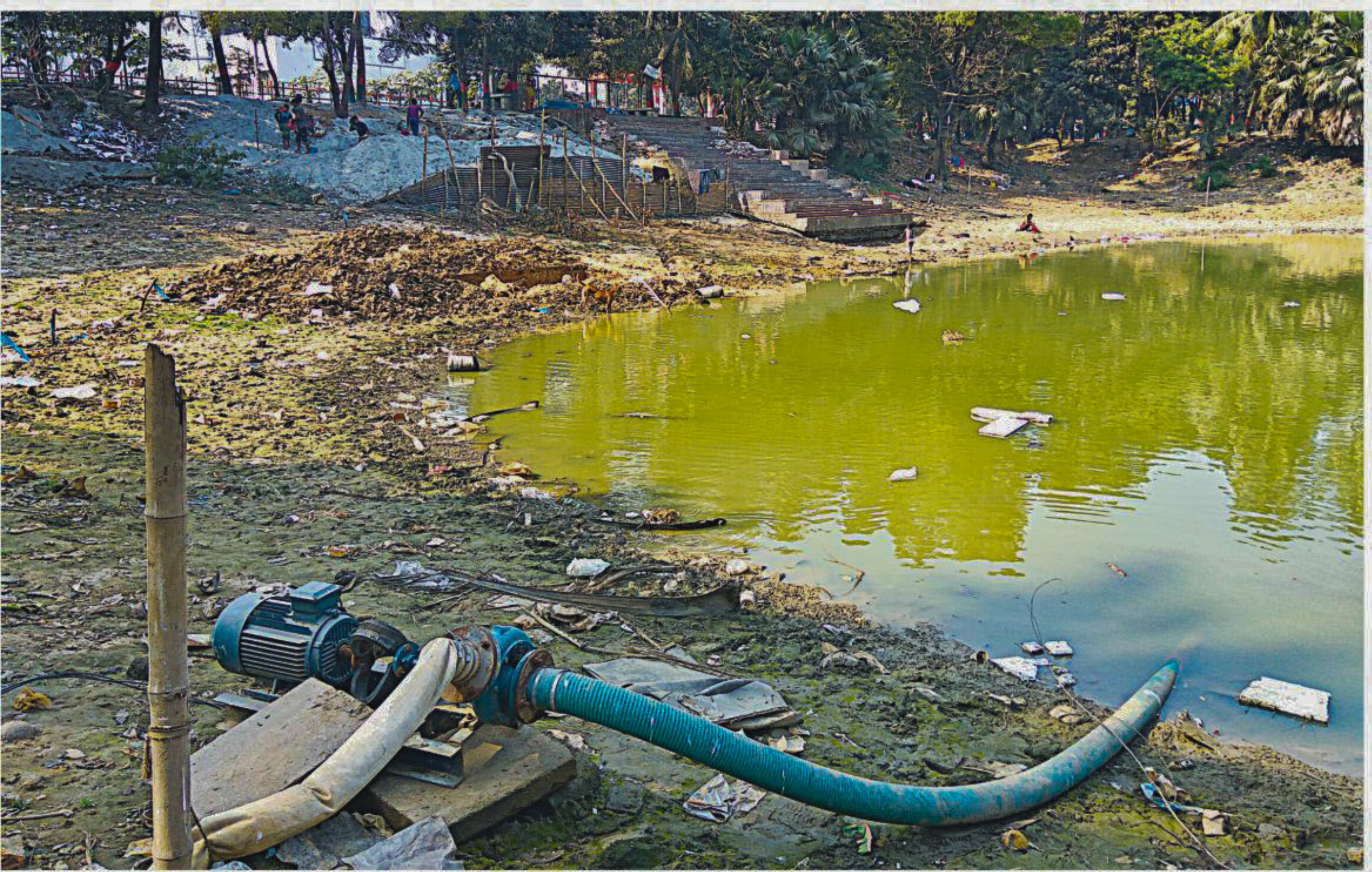
KILLING IT, SLOWLY... One by one the priceless water bodies, both natural and manmade, are being destroyed in and around the city, sometimes by the very authority that is supposed to protect those. The pond inside Gulistan Park in the capital is no different. It is slowly being destroyed by dumping of waste, bathing and washing clothes by vagrants, locals and visitors alike. Even the workers of the city corporation doing renovation work in the park are drying it up by extracting water from it. The photo was taken yesterday.