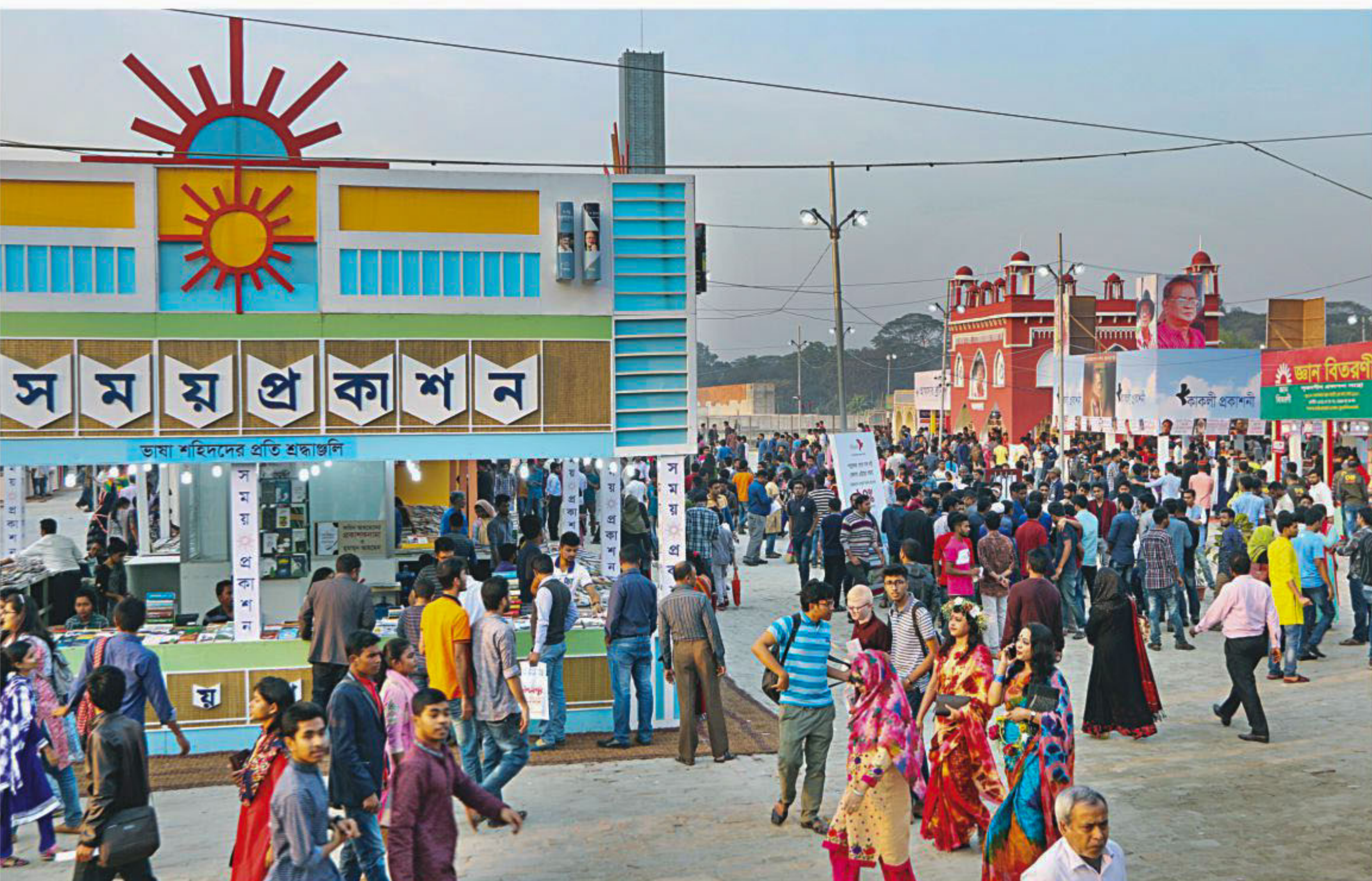
The month-long Ekushey book fair is gaining momentum with book enthusiasts of all ages thronging the fair. The photo was taken at Suhrawardy Udyan around 4:00pm yesterday.

He urged all concerned to come forward and address the situation.