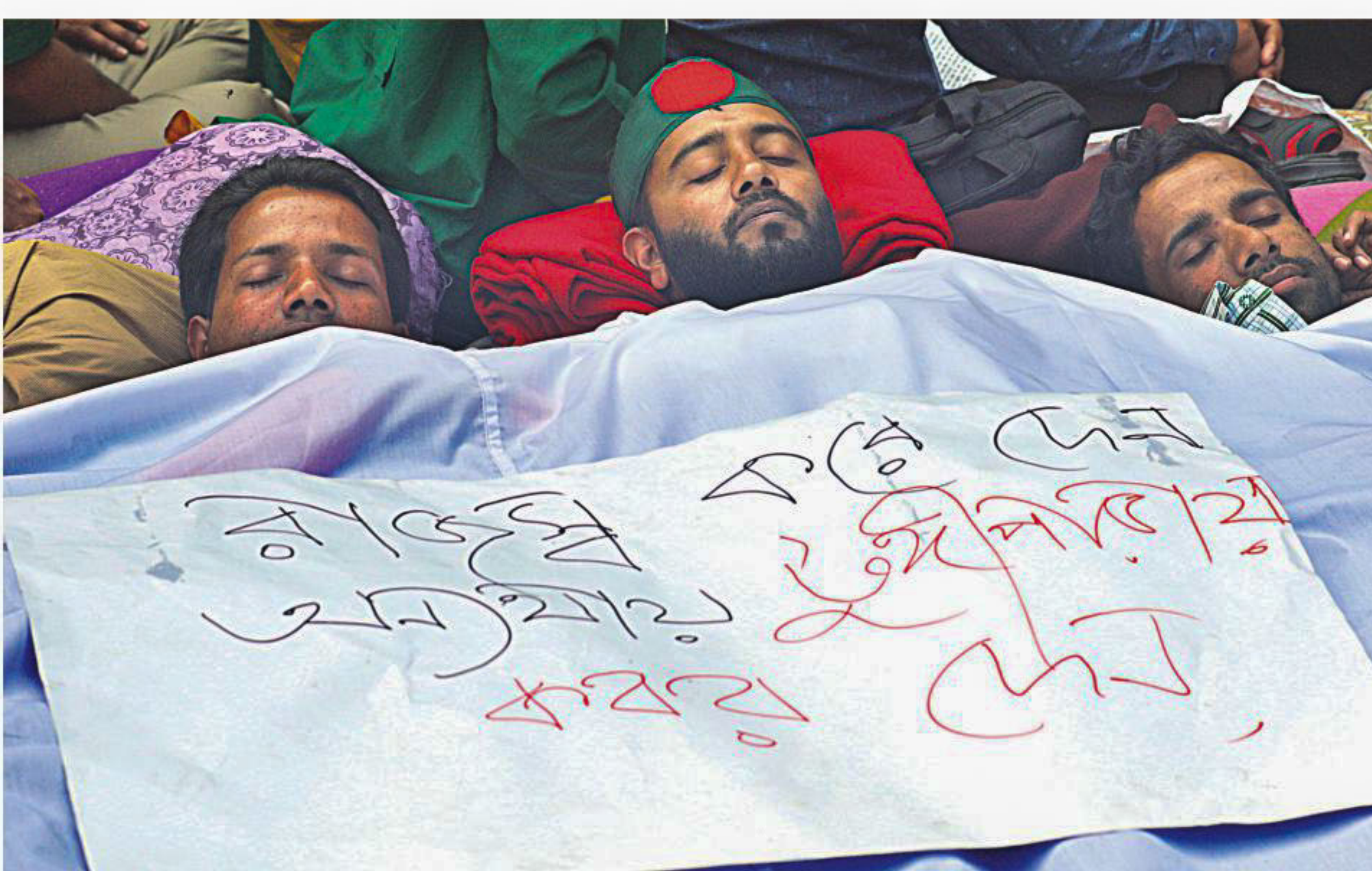
Community health care providers continue their hunger strike for the sixth day yesterday in front of Jatiya Press Club, demanding nationalisation of their jobs.