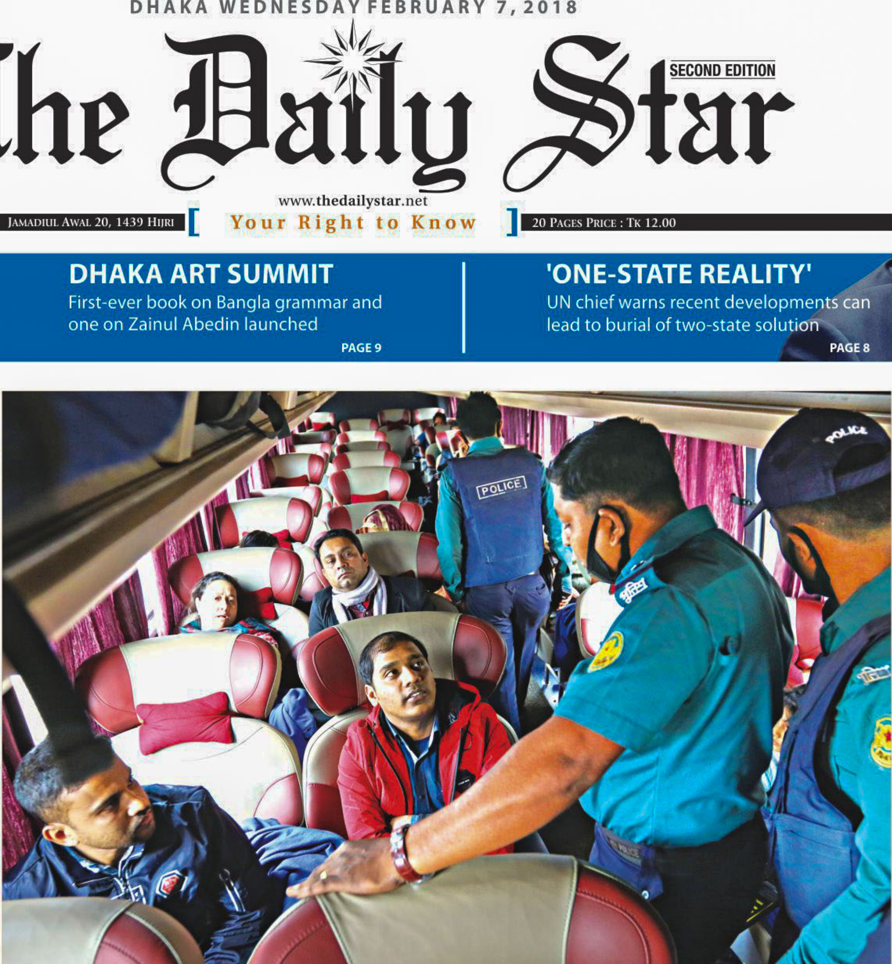
A cop enquires a passenger from Rangpur about the reason for his visit to the capital near the Gabtoli Bus Terminal around 10:30am yesterday. The government has put the law enforcers on high alert ahead of the delivery of the verdict in the Zia Orphanage Trust graft case against BNP Chairperson Khaleda Zia tomorrow.