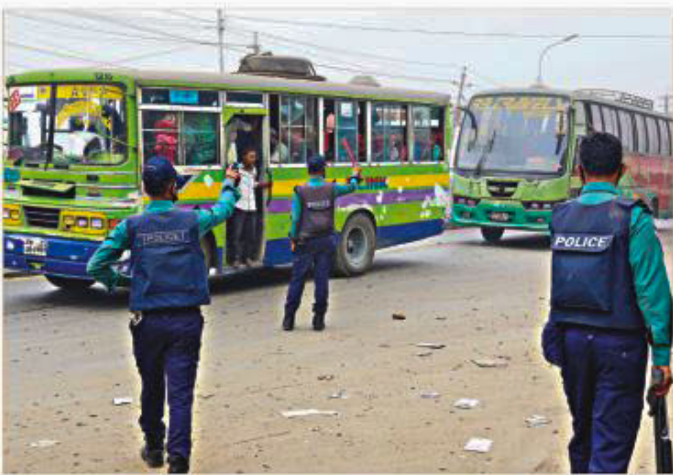
police sources said.

Law enforcers have taken a series of measures to prevent BNP supporters from entering the capital so they cannot gather on the streets centring on tomorrow's expected verdict in a corruption case against Khaleda Zia. As part of the move, police have already set up additional checkpoints at all the eight entry points to the capital. Also, law enforcers may cut off the capital from the rest of the country to prevent BNP men from coming to the city,