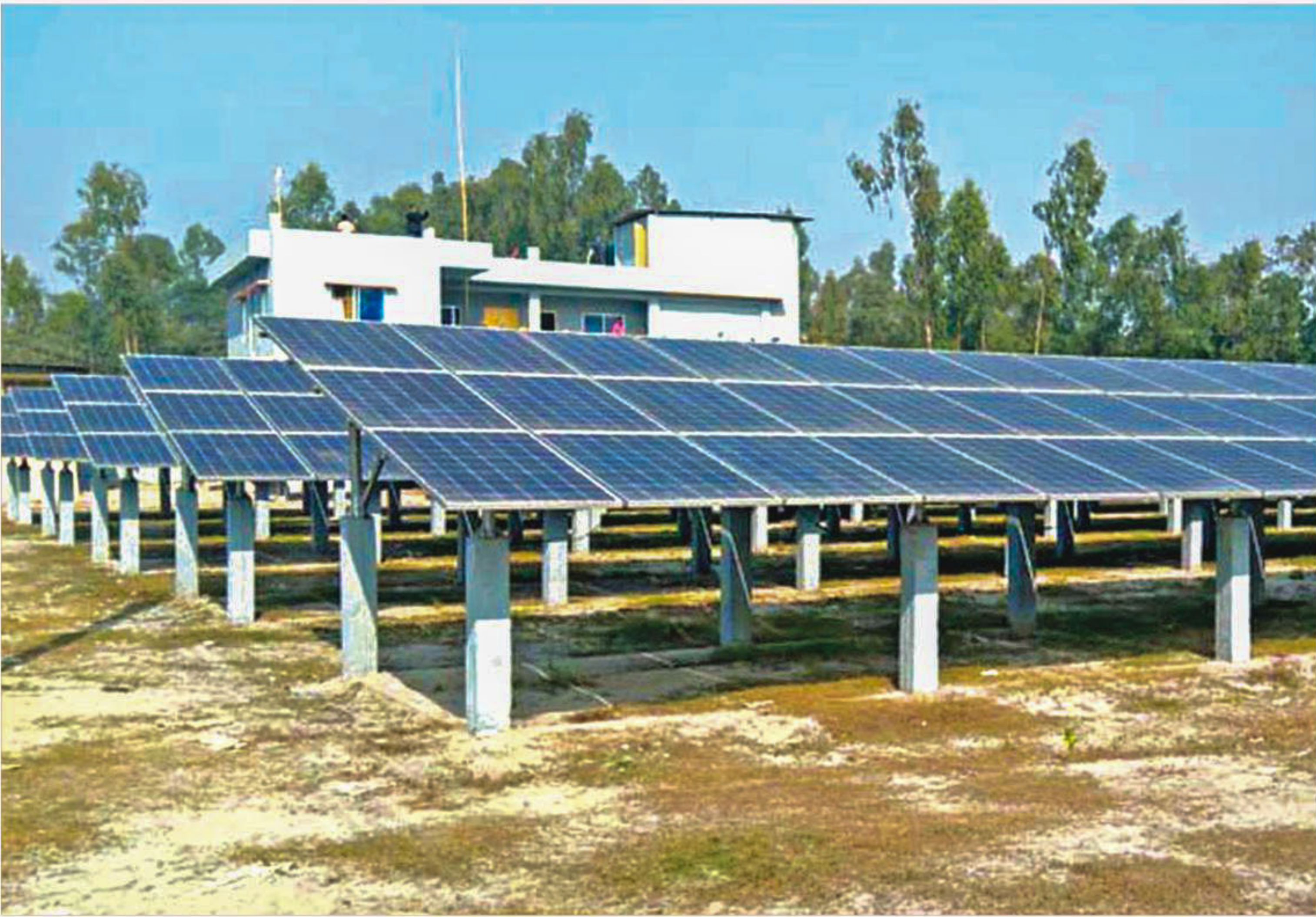
Over 100 households and 60 shops have been lit up with solar power in Munnia Char of Jamalpur's Islampur upazila. Solar panels were set up in this isolated char by a private company in December last year. On average, a household using the solar power will have to pay around Tk 360 per month. The photo was taken recently.