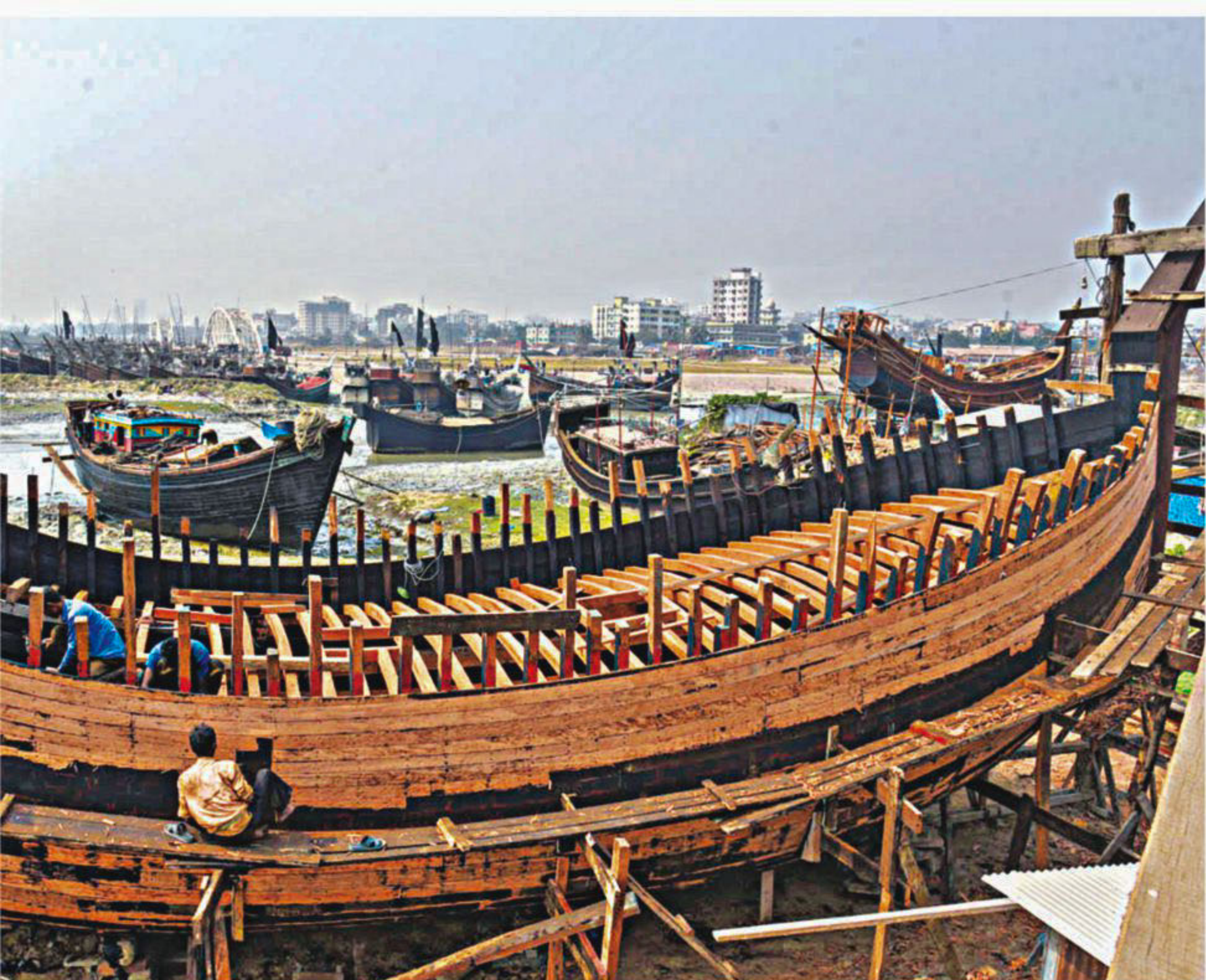
Every winter, the bank of the Karnaphuli becomes more vibrant as this is the season for making fishing trawlers. It takes nearly three months and costs around Tk 1 crore to build one of these boats. The photos were taken at Fisheryghat in Chittagong on Saturday.