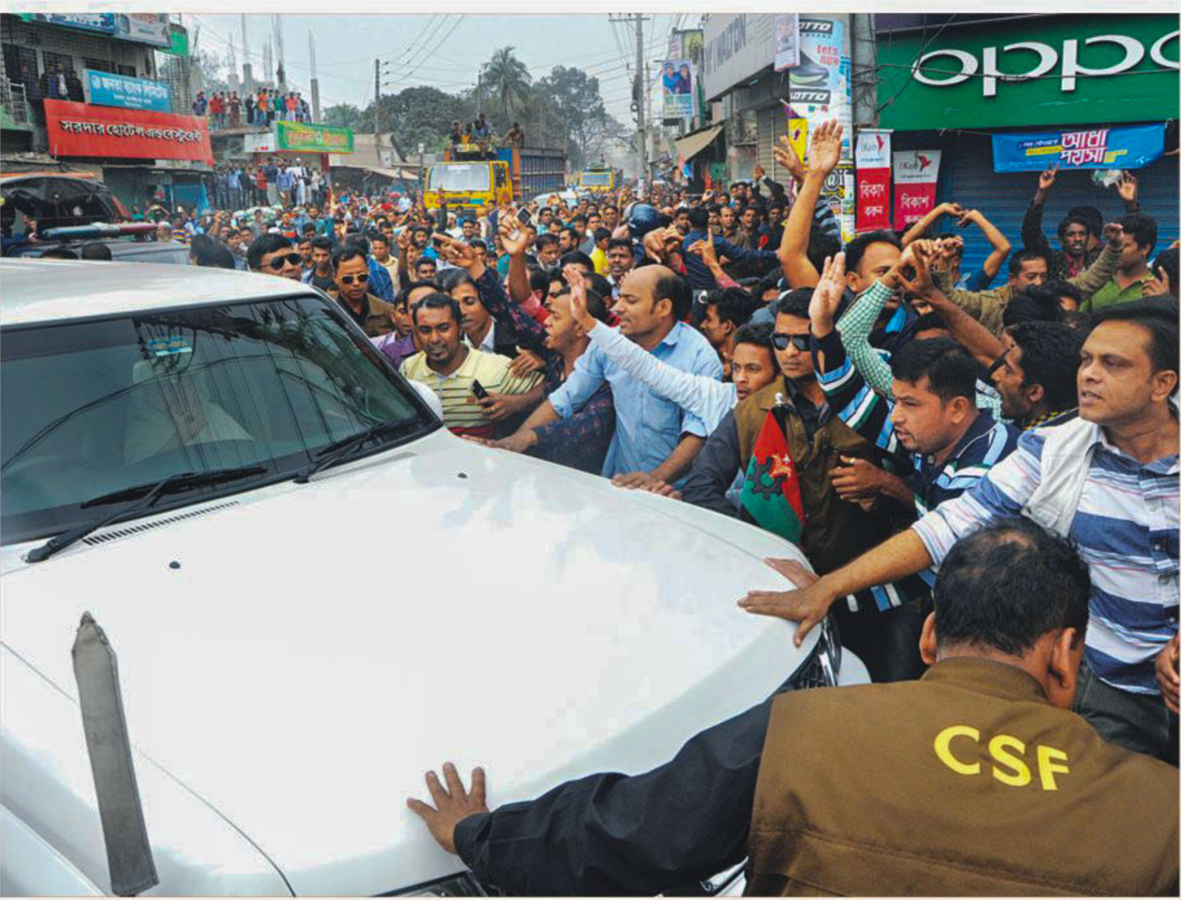
BNP Chairperson Khaleda Zia's security team clears way for her car through a crowd of activists and supporters in Kishoreganj as she heads for Sylhet yesterday.