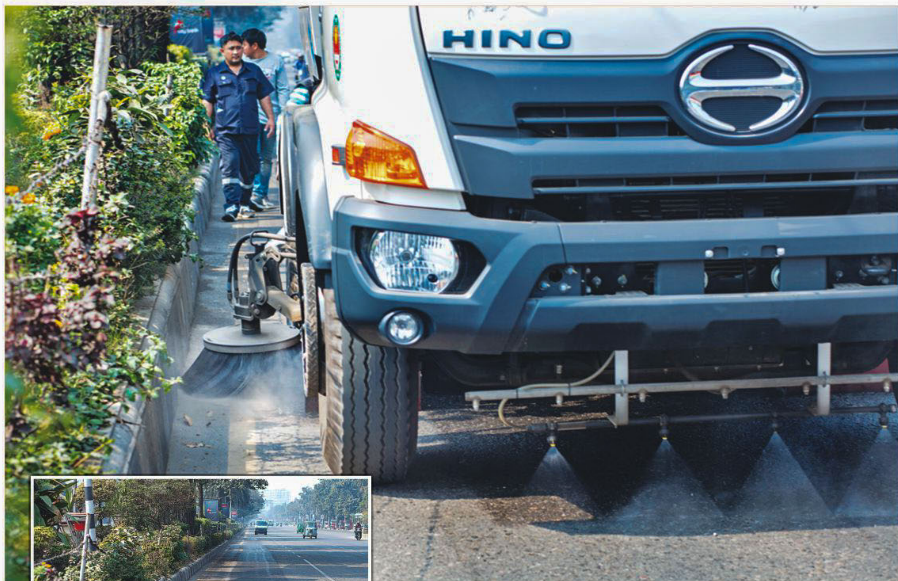
A Dhaka North City Corporation street sweeping truck cleaning Manik Mia Avenue in the capital yesterday. The two Dhaka city corporations imported a number of them in the last couple of years.