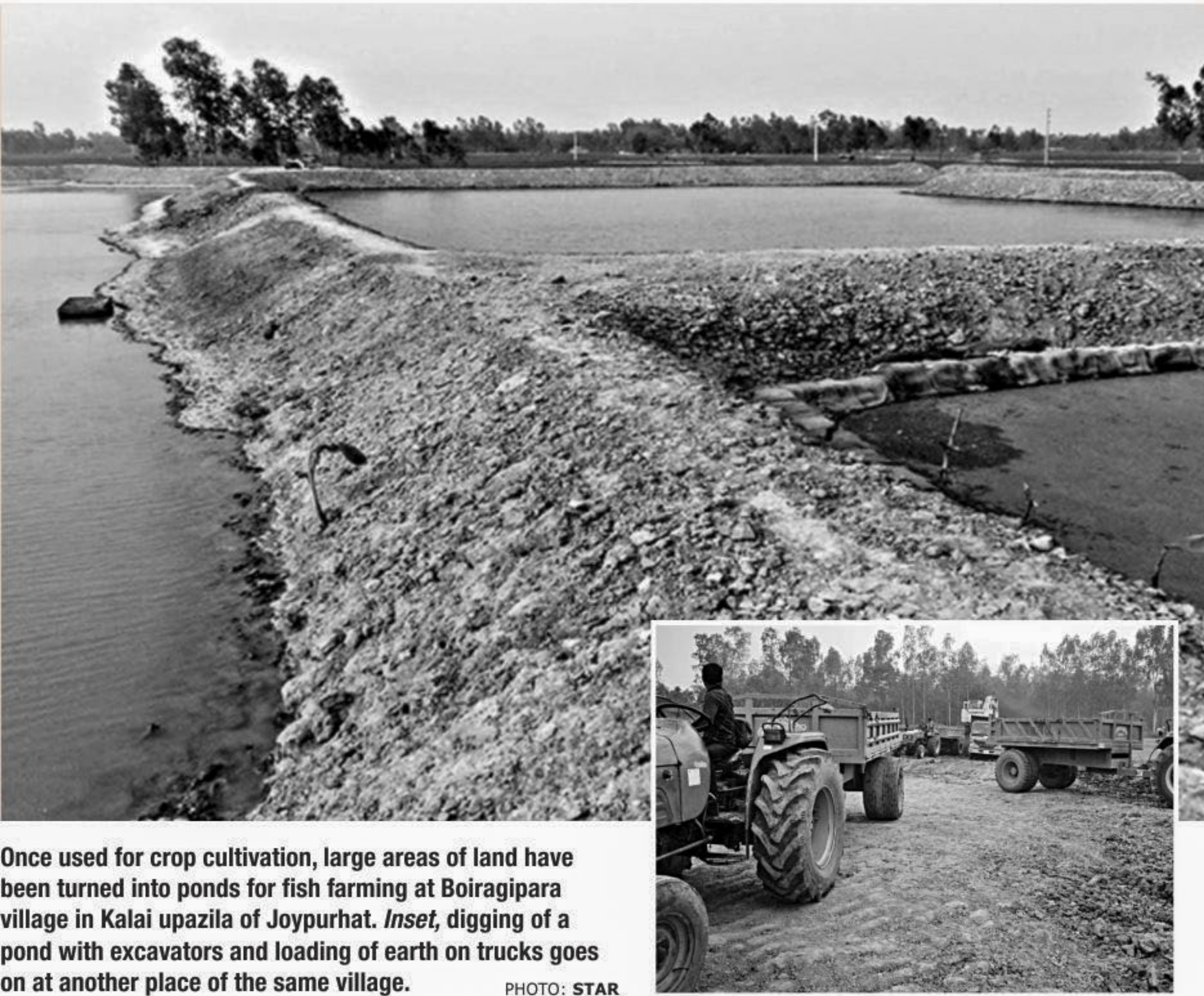
Once used for crop cultivation, large areas of land have been turned into ponds for fish farming at Boiragipara village in Kalai upazila of Joypurhat. Inset, digging of a pond with excavators and loading of earth on trucks goes on at another place of the same village.