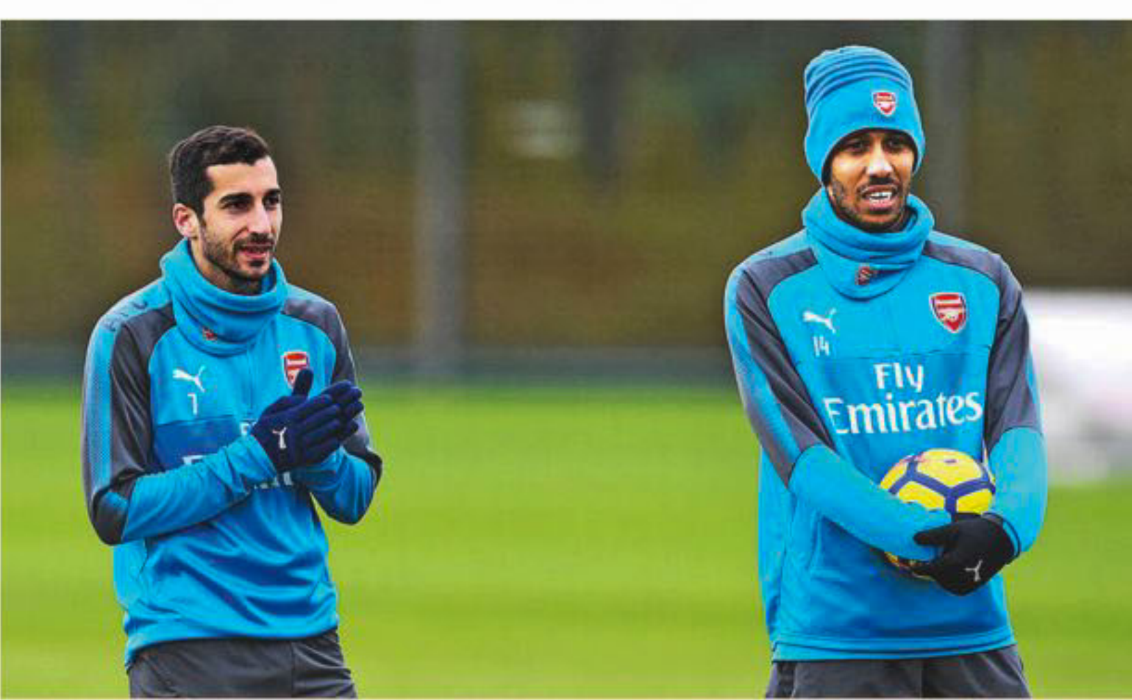
Having spent three seasons together at Borussia Dortmund, Pierre-Emerick Aubameyang (R) and Henrikh Mkhitaryan train for the first time after being reunited at Arsenal yesterday ahead of their match against Everton today.

The Gunners could also quickly come to rue their winter clearout as Theo Walcott returns to the Emirates fresh from scoring twice to secure Everton's first win of 2018 against Leicester on Wednesday.