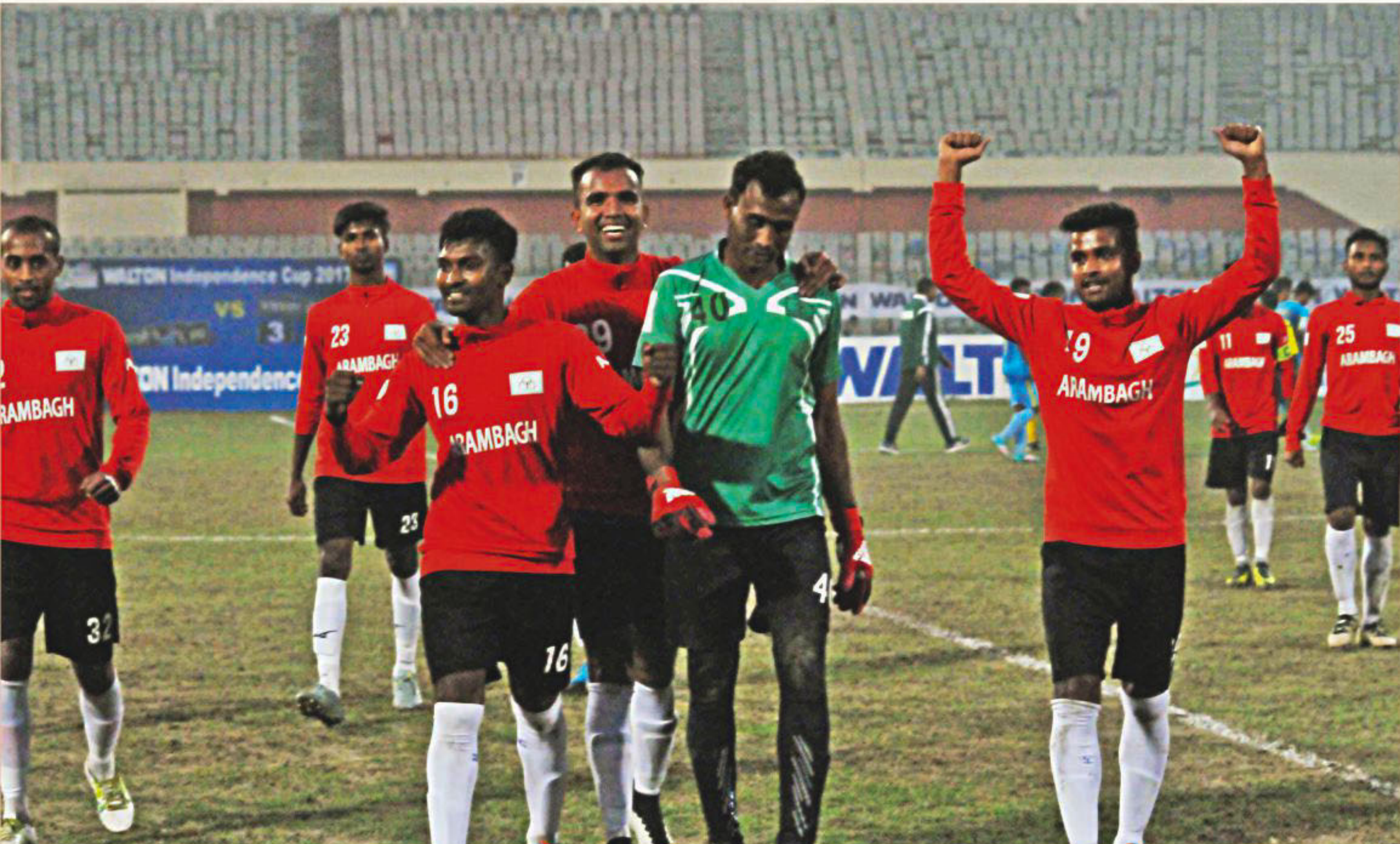
Arambagh players celebrate their 3-0 victory over Abahani in their Independence Cup quarterfinal at the Bangabandhu National Stadium yesterday.

Hertha Berlin are offering one fan the chance to win the "season ticket of a lifetime" in the truest sense of the word. The Bundesliga side are running a competition for one supporter to win a tattoo, but not just any tattoo -- a custom-designed tattoo that will also grant them passage into every single Hertha game for the rest of their lives. The chosen candidate gets more than one ordinary piece of art, because in addition to the blue and white flag, the city limits of Berlin and the silhouette of the Olympic Stadium, there is also tattooed a QR code. And that code is a ticket for all of Berlin's home Bundesliga matches -- the season ticket of your life! To enter, Hertha fans simply need to contact the club and tell them just why they deserve to win a seat for life at the Olympiastadion. -- AGENCIES