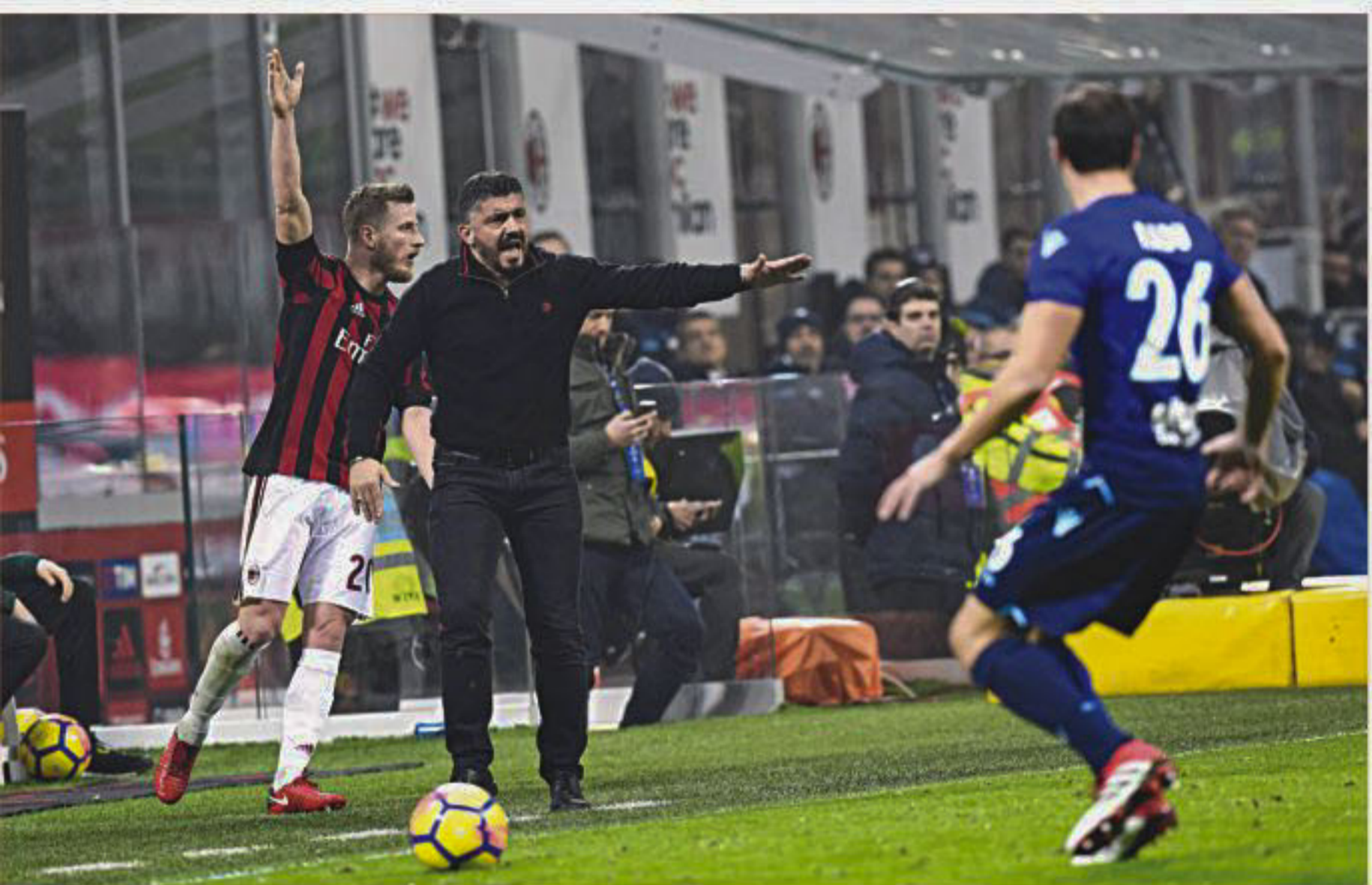
As vocal and hot-blooded as he was in his playing days, Gennaro Gattuso's unique brand of encouragement seems to be working wonders for his former club AC Milan.

"After the first game this season, you (the media) tried to put pressure on my job. But I'm trying to do my best."