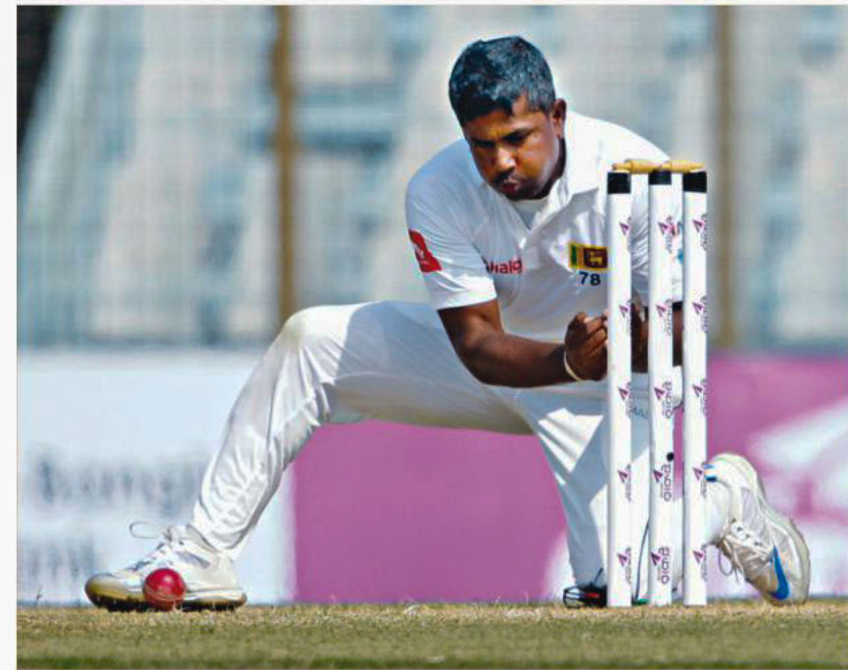
Sri Lanka left-arm spinner Rangana Herath unsuccessfully attempts to run out stand-in Bangladesh skipper Mahmudullah Riyad yesterday.

The pitch at the Zahur Ahmed Chowdhury Stadium has been a source