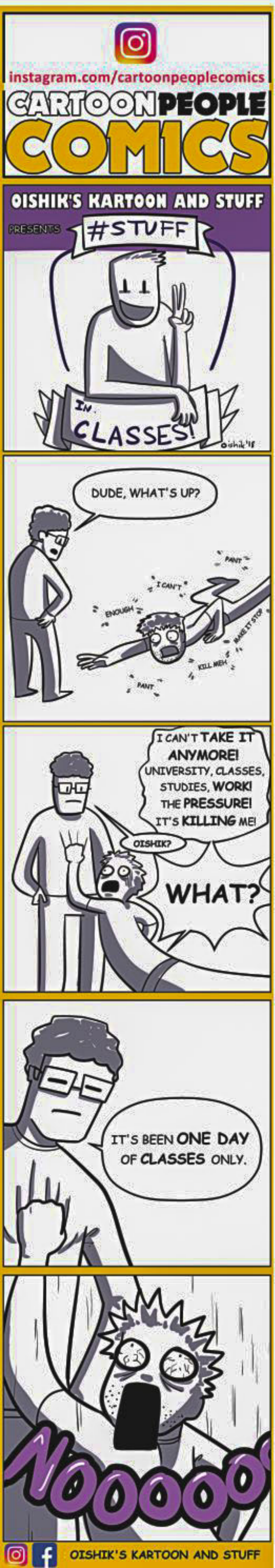
COMICS: OISHIK JAWAD