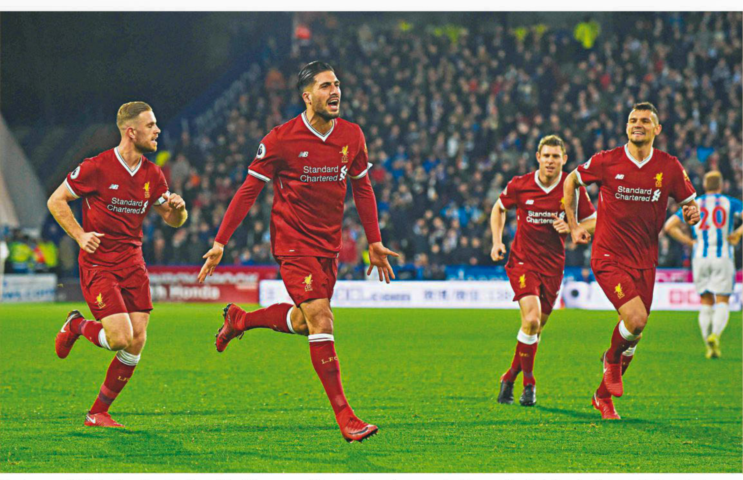
Wantedway midfielder Emre Can (2nd from L) put in a man-of-the-match performance for Liverpool in their Premier League clash against Huddersfield on Tuesday, scoring the opening goal with a blazing half-volley in a 3-0 win at the John Smith's Stadium.