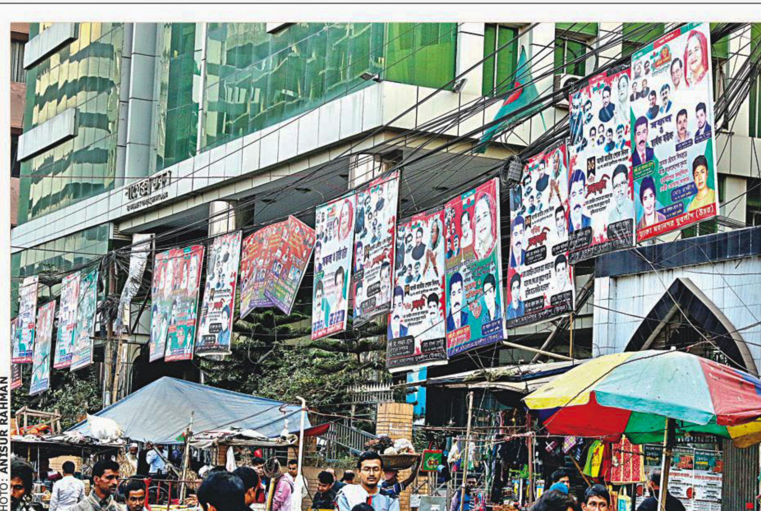
Banners of various political parties hanging from utility cables in the capital. Be it on the walls or hanging from top, the city seemed to be flooded with these eyesores. The photo was taken at Karwan Bazar on Tuesday.

As per the law, the EC publishes a draft updated voter list on January 2 every year, while the final updated voter list on January 31 every year disposing of complaints over fresh voters, if any. Meanwhile, Chittagong district has got 1,62,828 voters. With the current addition, the total number of voters is now 19,50,669 in the port city and 36,94,714 in its 15 upazilas.