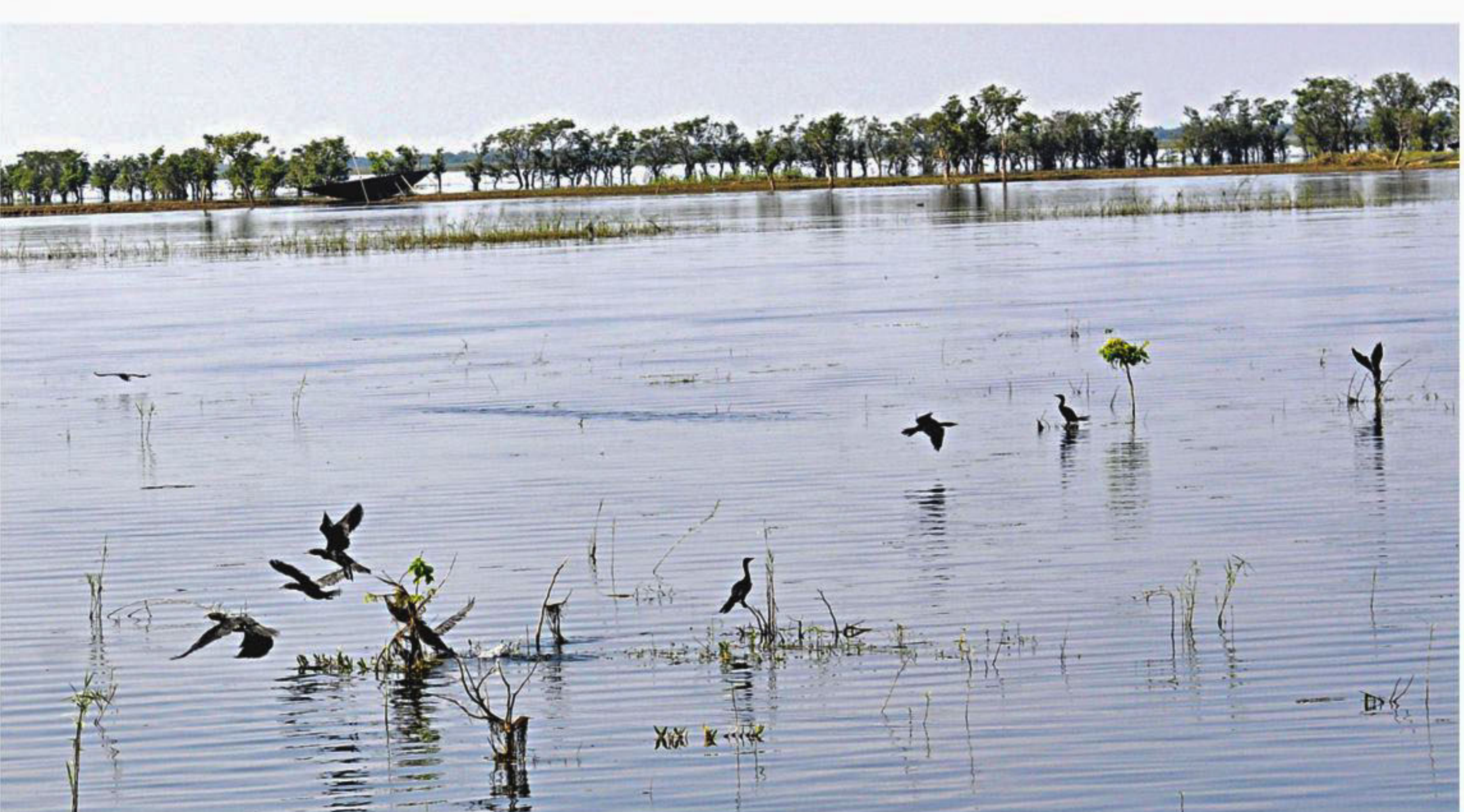
Once a popular hotspot for migratory birds during winter, Tanguar Haor has worn a deserted look this time. Man-made causes like illegal hunting, destruction of biodiversity and climate change contributed to the decline in the number of winged guests visiting the area. The photo was taken recently.