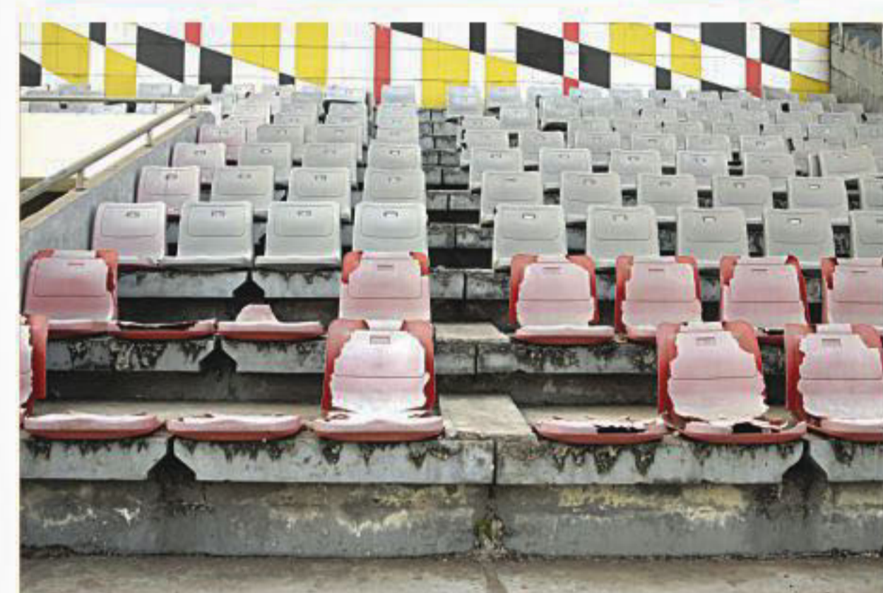
(Centre) An aerial view shows the current state of the Bangabandhu National Stadium, the premier multipurpose sporting venue of the country. (Top-L) While the two international dressing rooms look neat and clean and need little refurbishment, the two dressing rooms for domestic matches (Bottom-L) are in shabby condition, lacking decent facilities. Similarly (Top-R) the President's Box looks pretty tidy while there is a lot to be done to the seating arrangements at the general gallery. The pictures were taken on January 22.