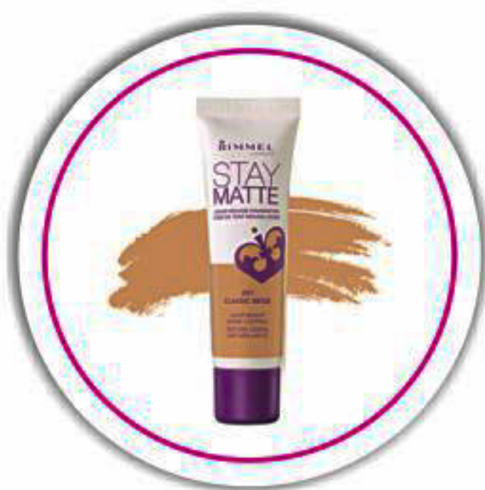
Rimmel Stay Matte Foundation