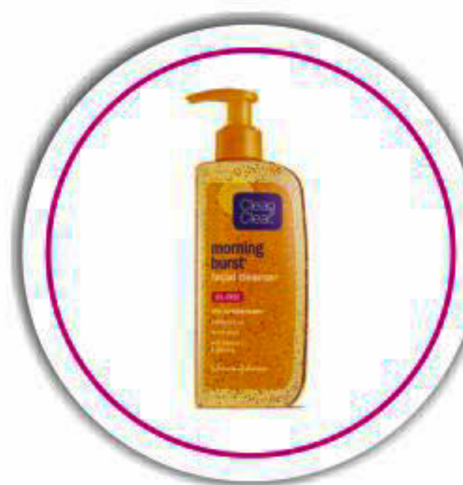
Clean and Clear Face Wash