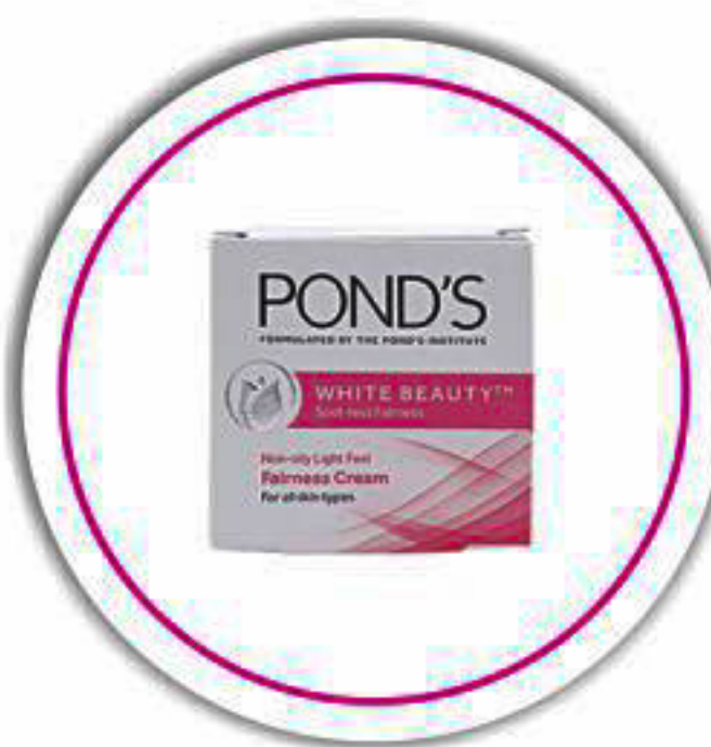
Ponds White Beauty Day Cream