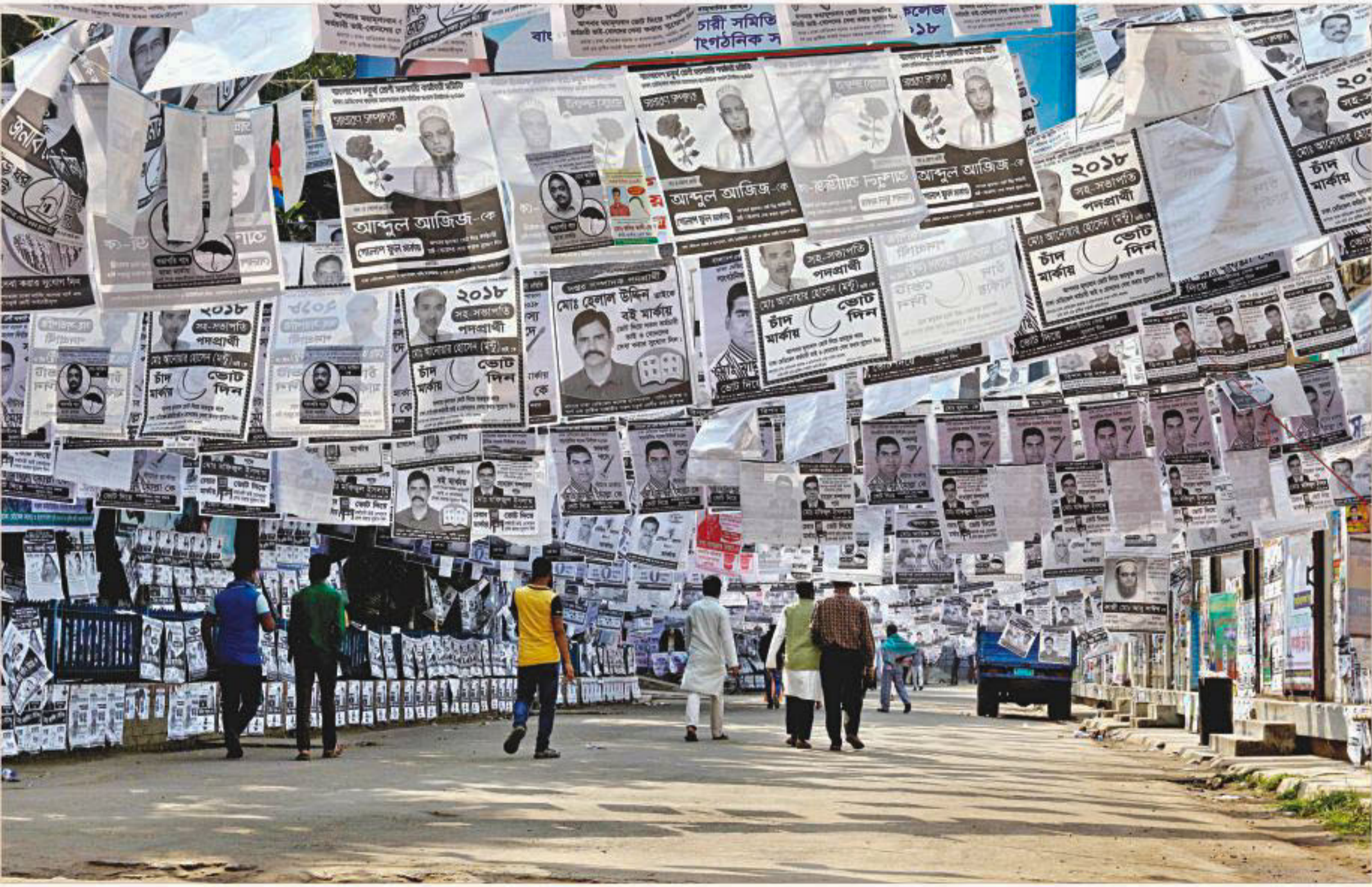
Numerous posters have flooded the Dhaka Medical College Hospital complex ahead of class-IV employees' union election to be held today. The DMCH authorities have reportedly asked the candidates to remove the posters and banners, but those are still there causing visual pollution at the country's leading public hospital.