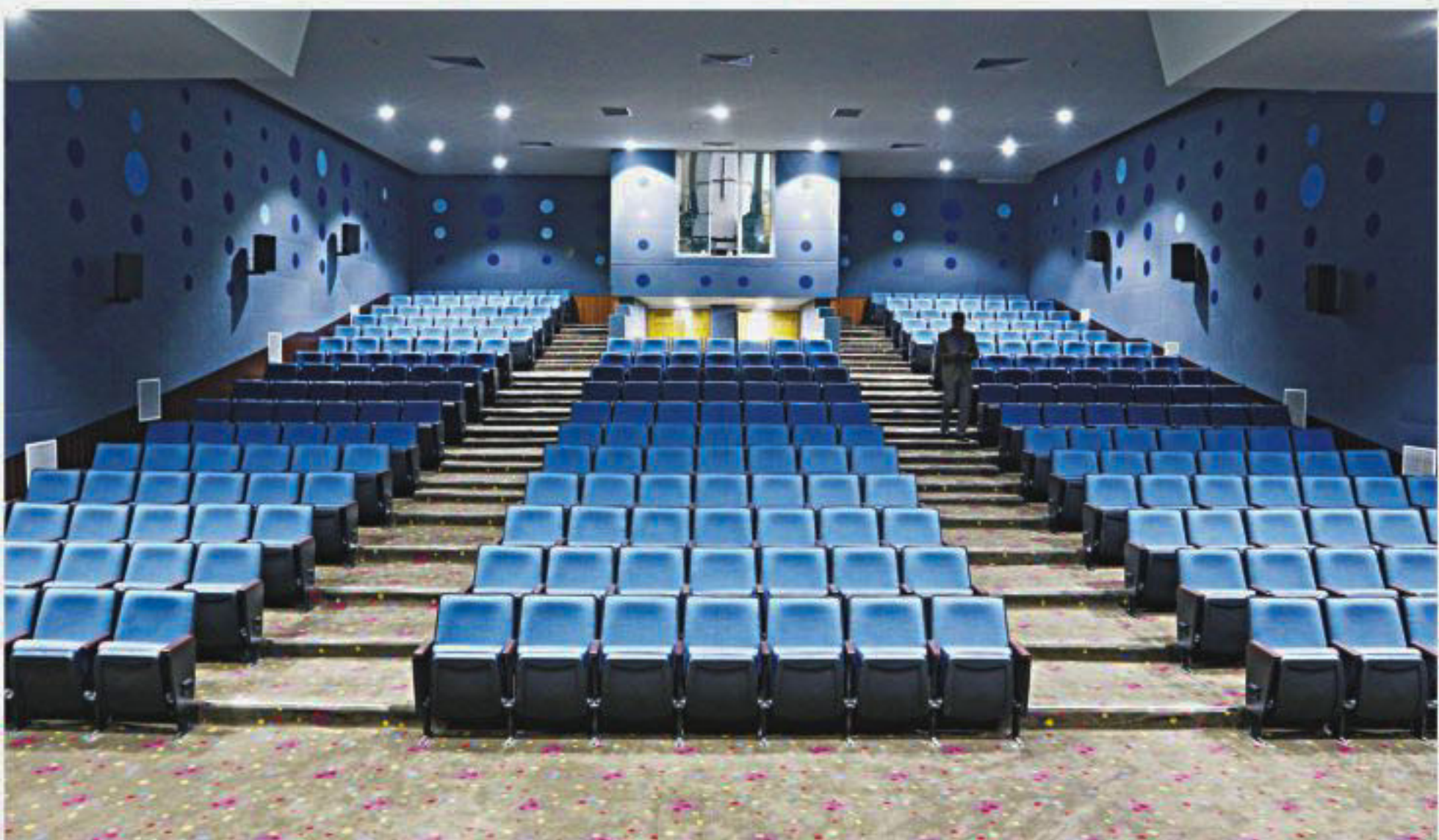
BFA's movie theatre (L); the film vault, where reels are stored at a freezing -8 degrees celsius.