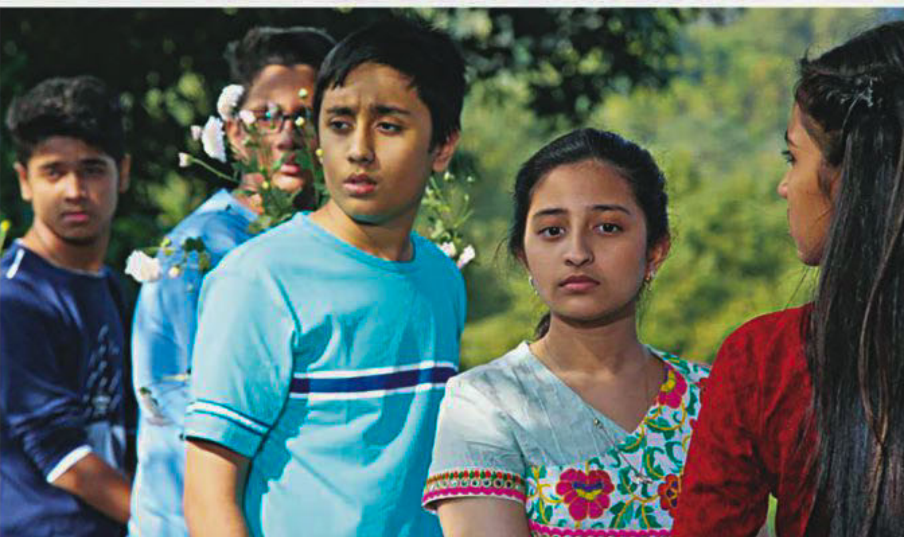
A scene from "Ankhi O Tar Bondhura".

Among the 225 films, two other Bangladeshi films -- "Boka Khey