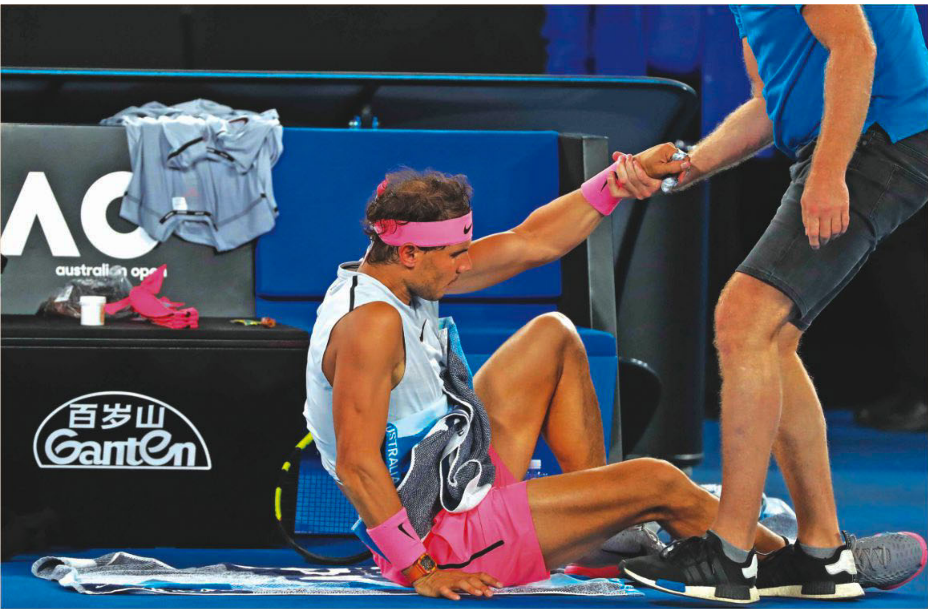
World No. 1 Rafael Nadal is being helped onto his feet by a physio after he picked up a leg injury, forcing him to forfeit his Australian Open quarterfinal against Marin Cilic during the fifth set.