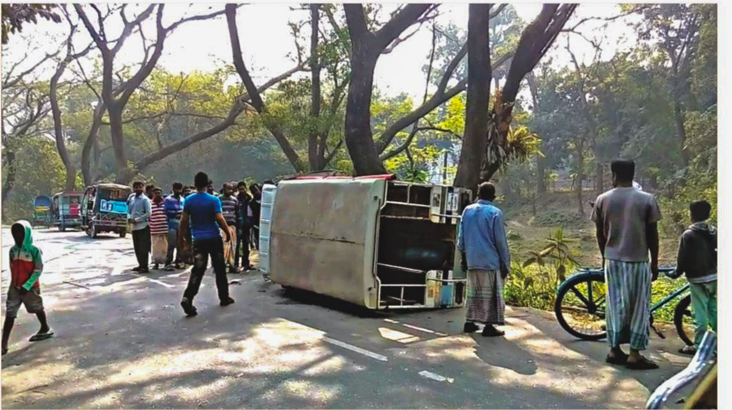
A leguna (locally modified pickup truck) that flipped over after being hit by a similar vehicle in Malkhanagar area of Sirajdikhan upazila in Munshiganj yesterday. Ten people including five policemen and two accused in their custody, travelling in the leguna, were injured. The requisitioned vehicle was on way to Dhaka Central Jail from Munshiganj jail, said police.