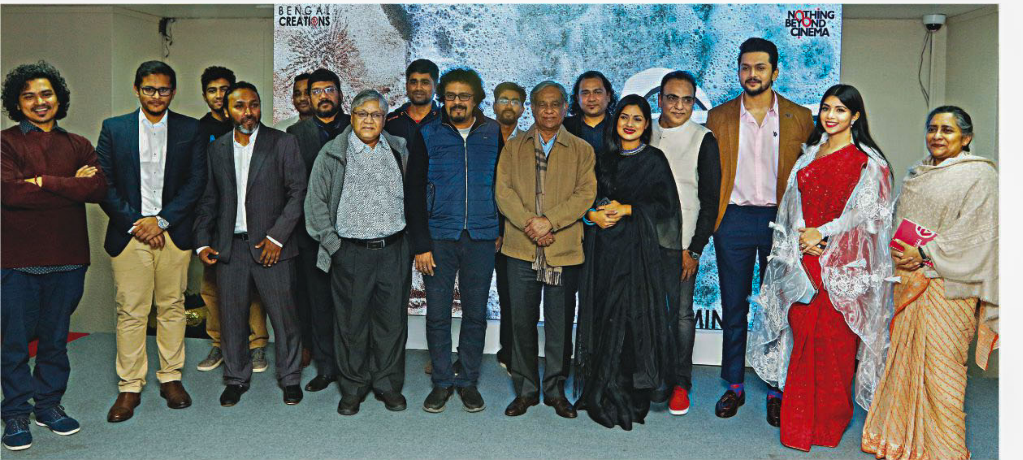
The director (4-R), producers and casts among others at the press conference.