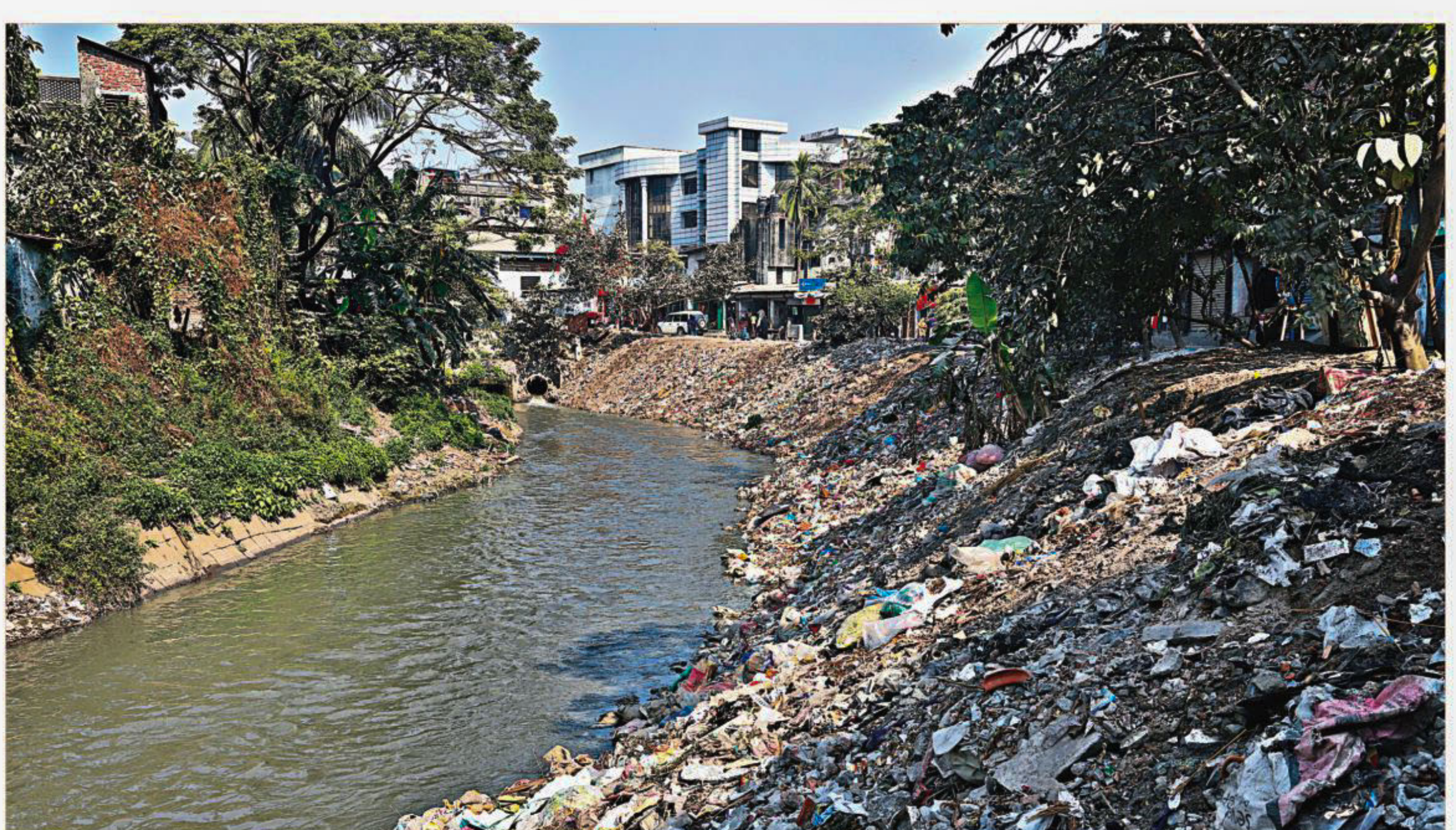
There was a time, this stream in the capital's Sutrapur area used to be a mighty canal. But over the years, it was reduced to a narrow drainage outlet, de-linking it from the Buriganga. Meanwhile, unabated dumping of waste continues to threaten its existence. The photo was taken at HKB Khalpar yesterday.