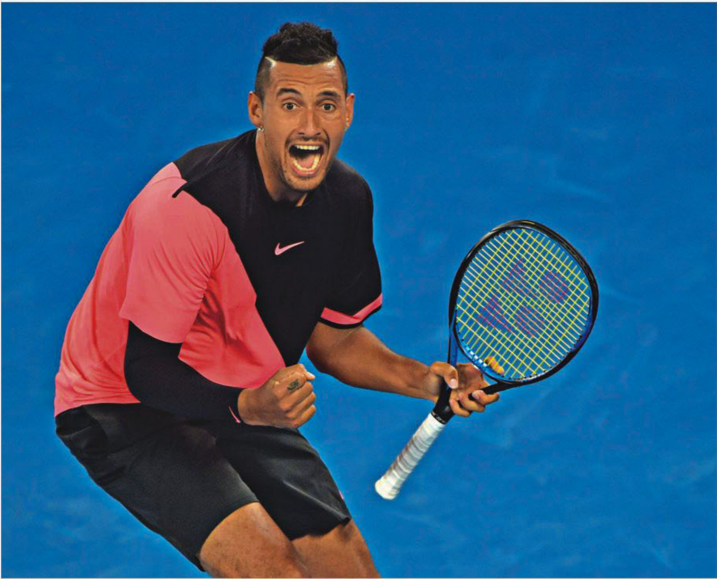
Australia's Nick Kyrgios is ecstatic after his victory over France's Jo-Wilfried Tsonga in the men's singles third round match of the Australian Open in Melbourne yesterday.

"These are professional athletes," he said.