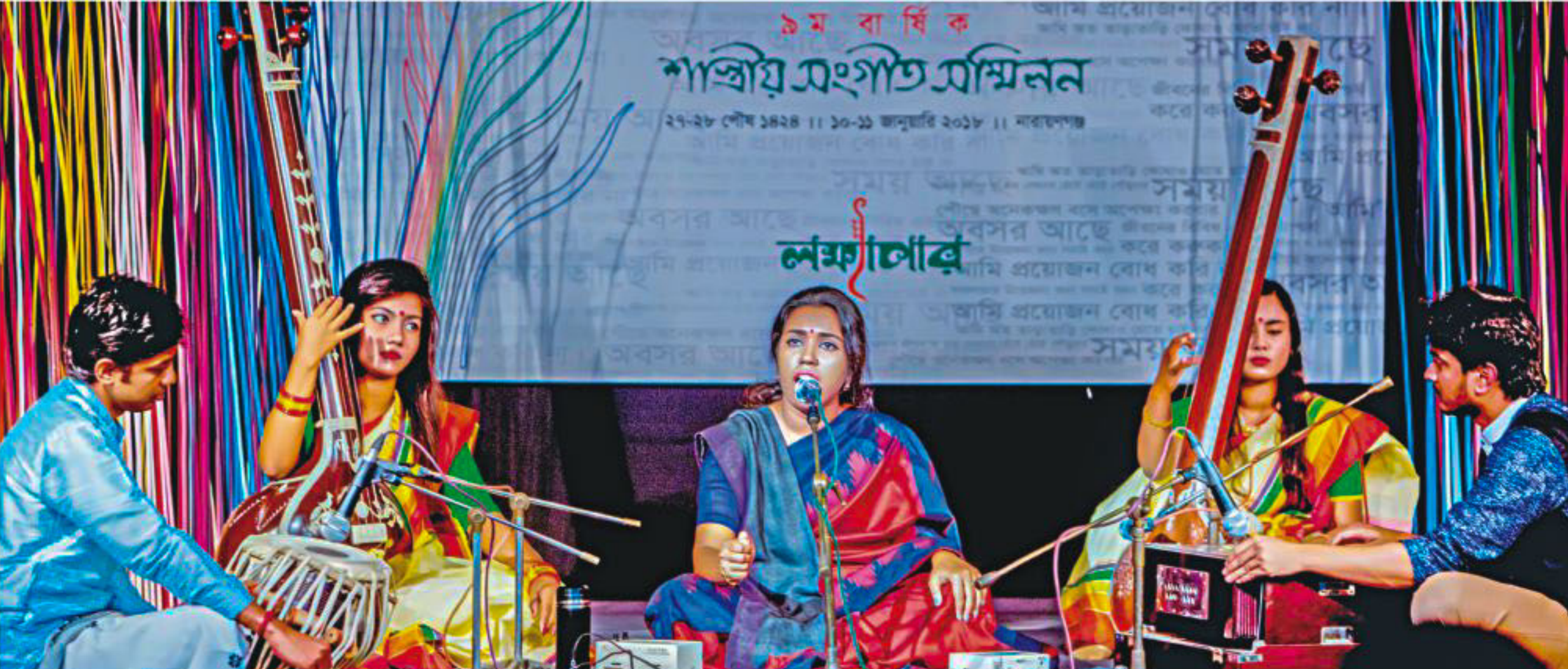
The conference featured many evocative moments.