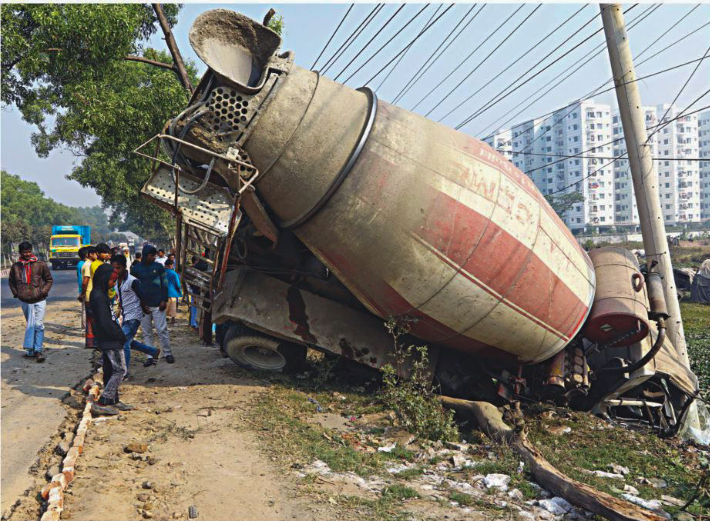
The driver of this concrete mixer truck lost control over the steering and hit an electric pole in Savar's Bank Town area yesterday. The driver died on the spot while his helper sustained injuries.