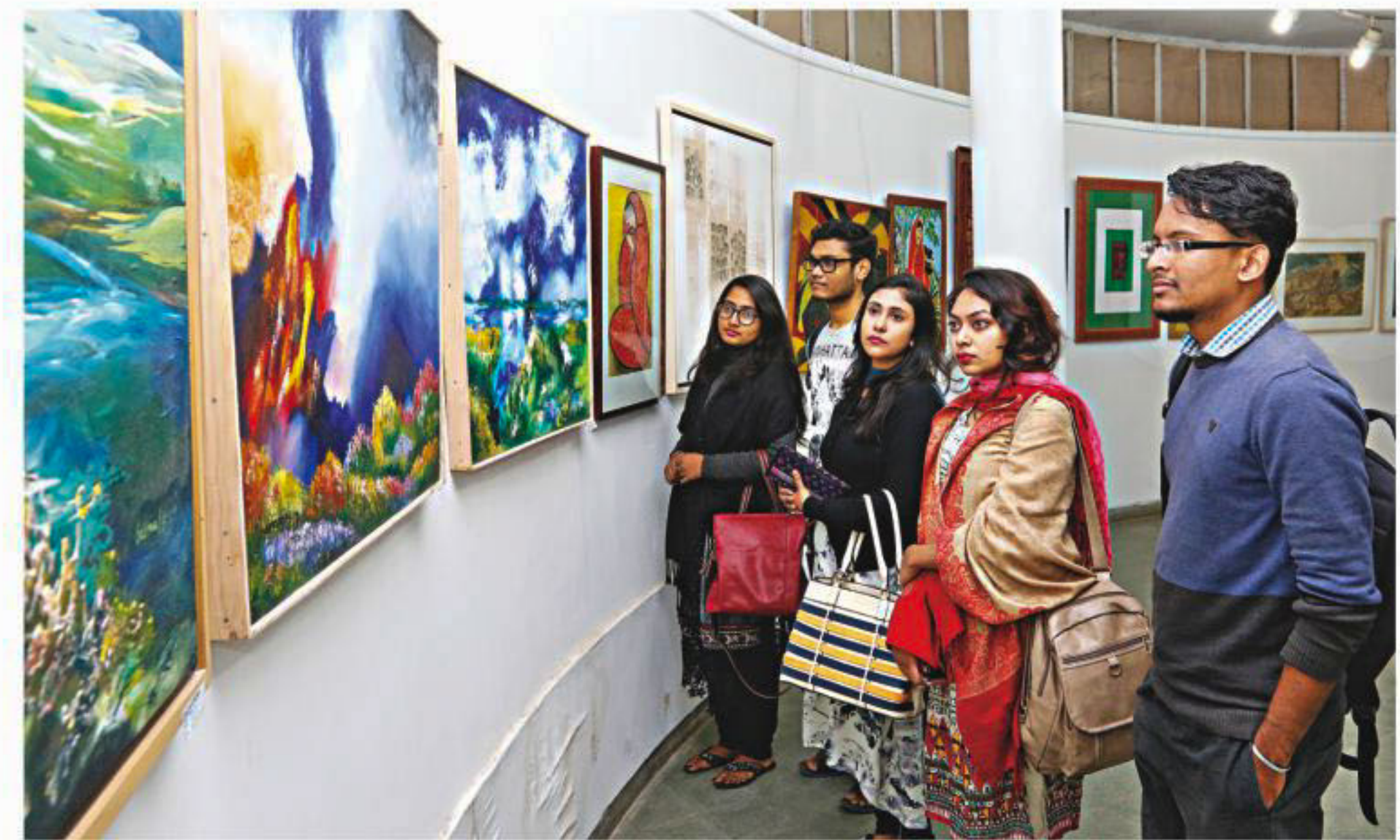
Visitors at the exhibit.

turing some 50 artworks by 29 artists. The participating artists have displayed their diverse works on media like watercolour on paper and canvas, acrylic, mixed media, sculptures made from wood, cement and steel, ceramic paintings and aesthetic decorative works on porcelain. Nature with her varied elements, landscape, folk themed works, portraits, abstract and feminine face and grace are the dominating subjects of the paintings on display while the showcasing sculptures have conspicuous connotations of contemporary approach and language. However, the exhibition would have been more meaningful if there was enough space in between the displayed works. The show, opening from 12noon to 7pm daily, will conclude on January 21.