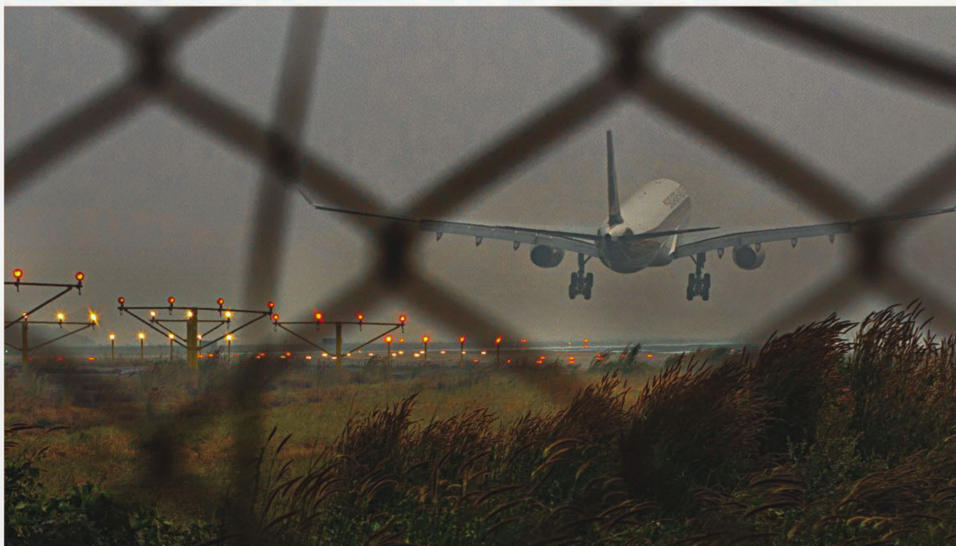
An international flight lands at Hazrat Shahjalal International Airport amid fog around noon on Sunday. Poor visibility led to suspension of flight operations for hours every day over the last seven days.