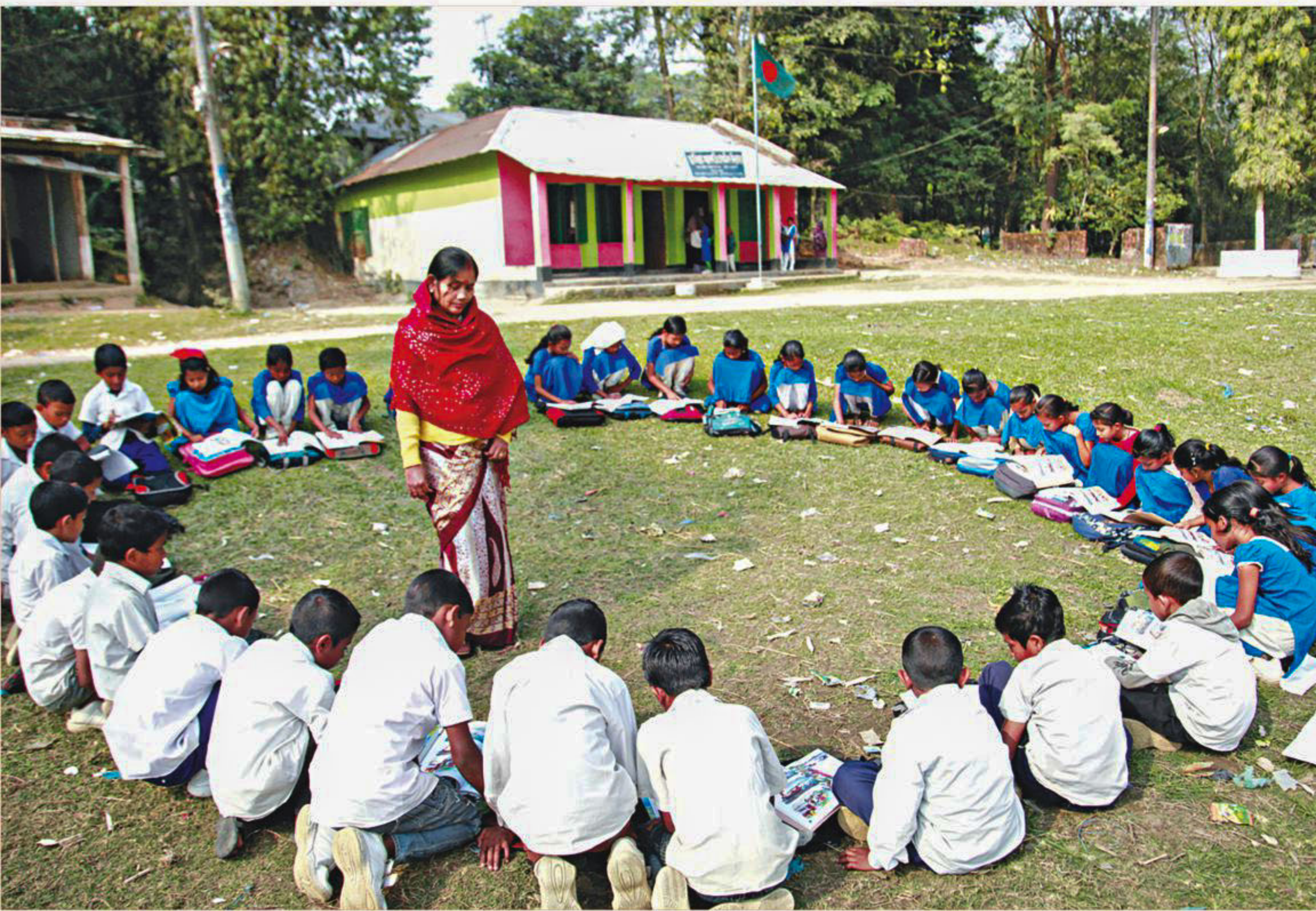
A teacher of Chhalia Government Primary School in Sylhet imparting lessons on the school playground due to a shortage of classrooms. The number of classrooms at the school is inadequate in comparison to the number of students there. The photo was taken recently.