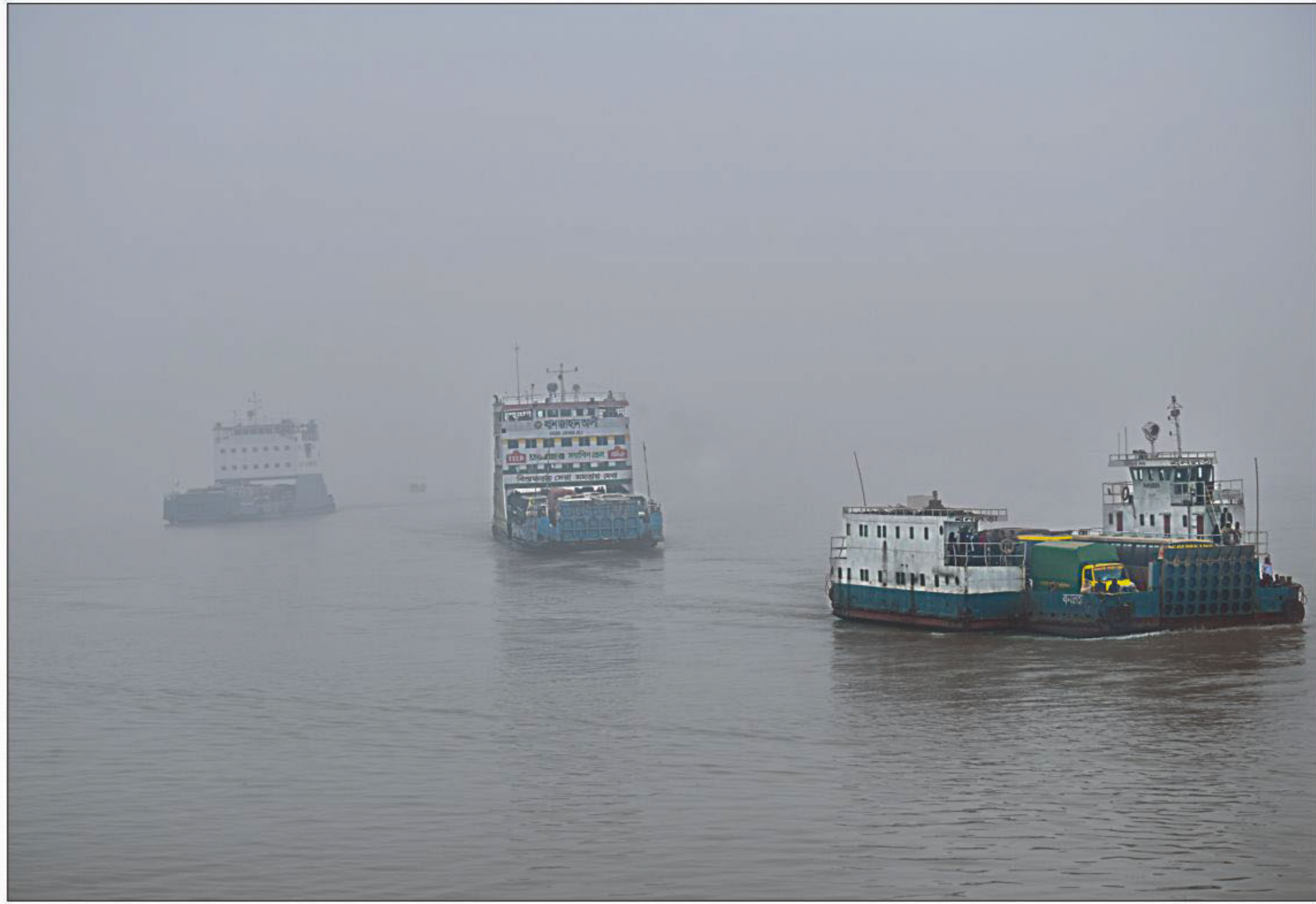
Vessels move amid thick fog on the Paturia-Daulatdia route in the Padma around 11:30am yesterday. Ferry service on the route was suspended for eight hours since 2:00am due to poor visibility, leaving thousands of bus passengers stranded on both sides of the river.