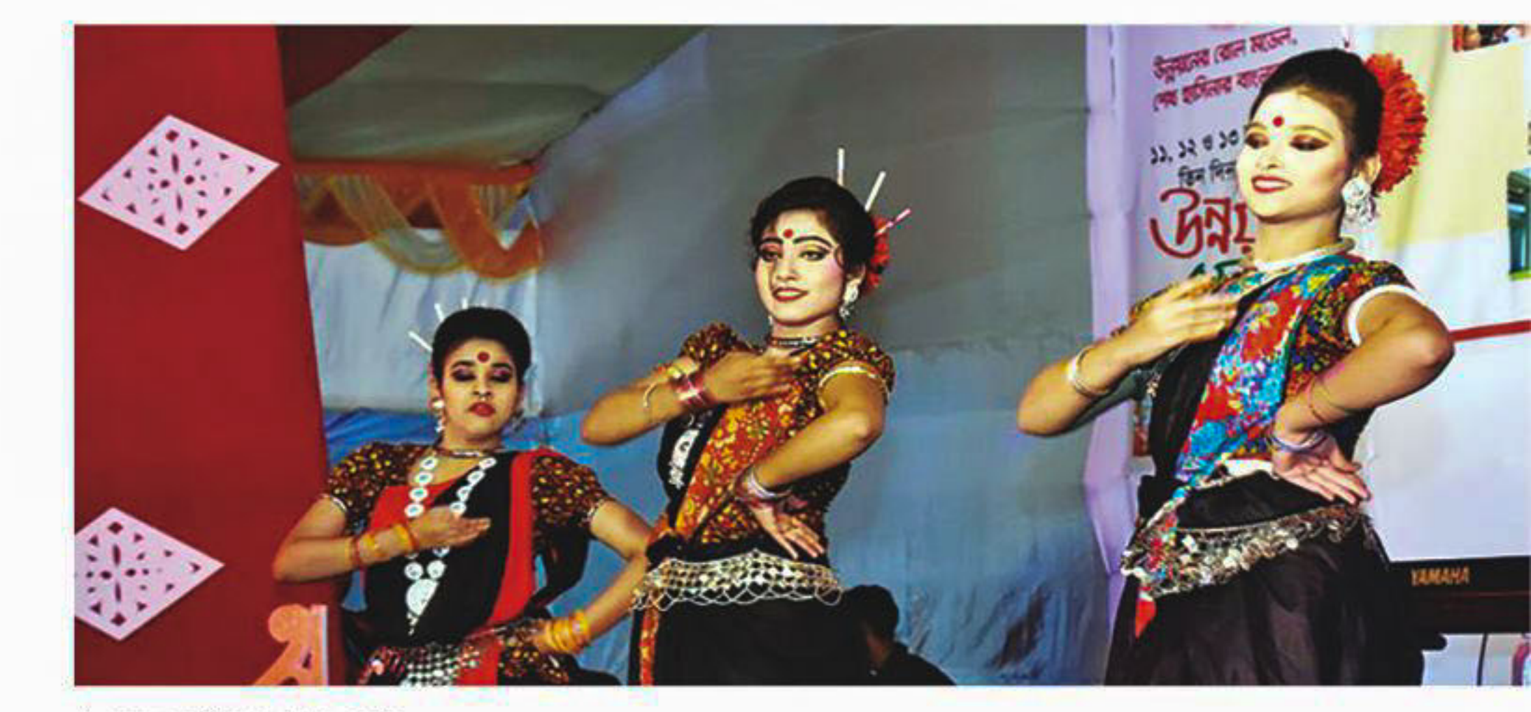
A scene from the pala.